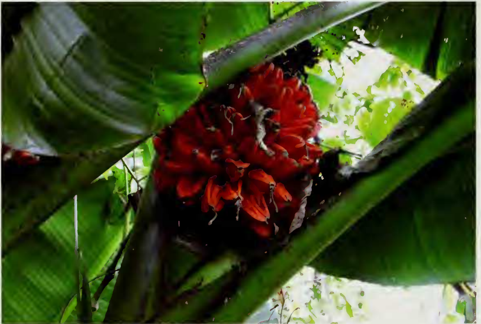
Figure 2. Musa arfakaina with mature fruit.