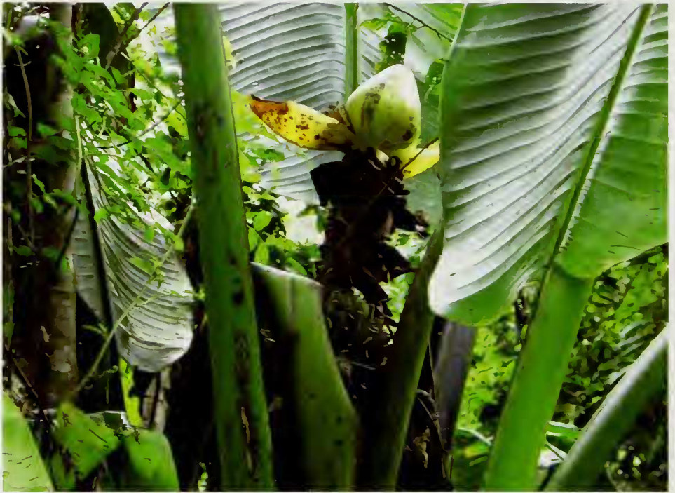
Figure 1. Musa arfakiana with inflorescence showing the male bud.