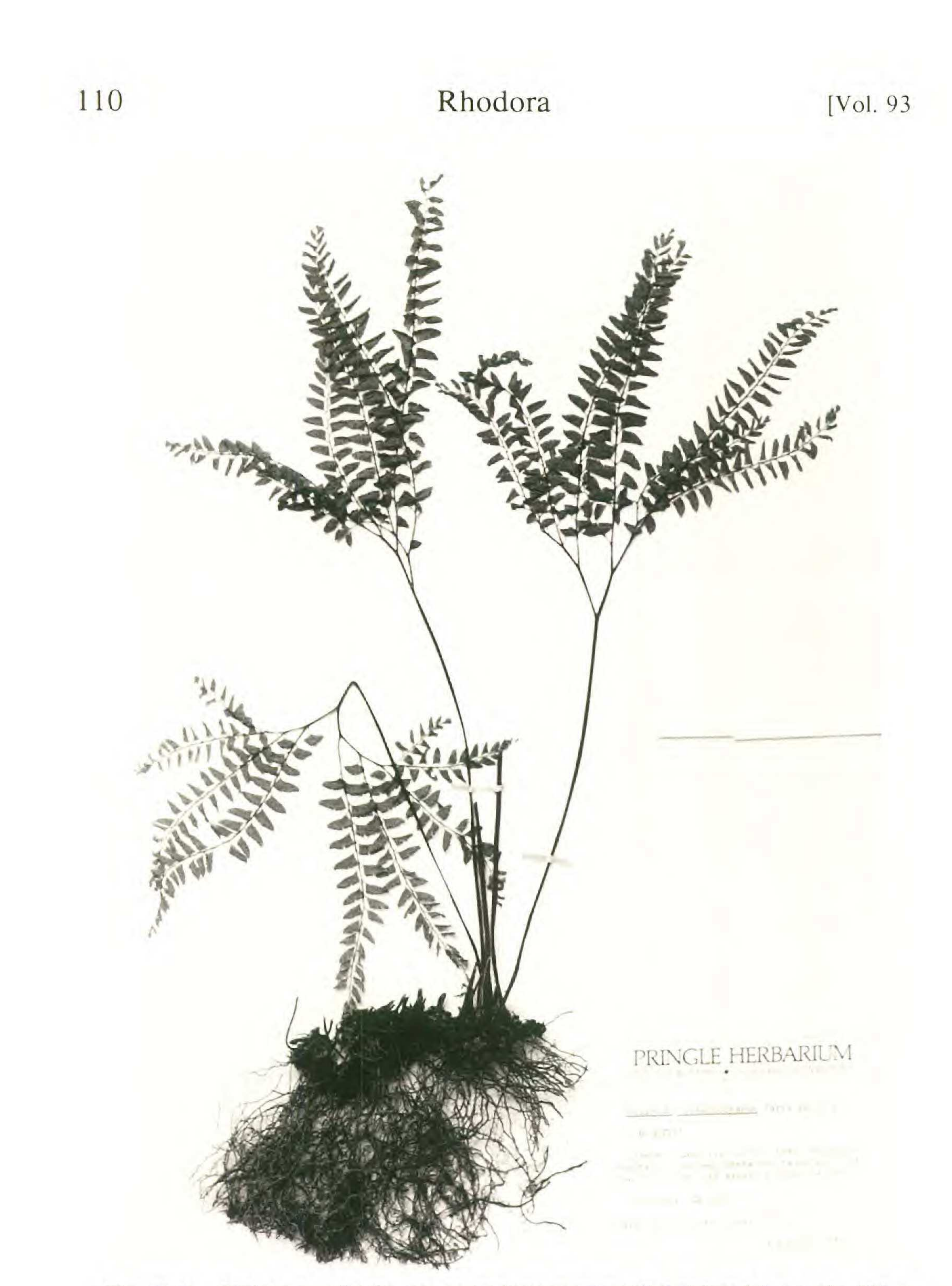
Figure 2. Holotype of Adiantum viridimontanum (Belvidere Mountain, Eden, Vermont, 28 August, 1985, Paris 856 (vT)).

atropurpureous, lustrous, 2.0–3.0 mm diam., with a single, guttershaped vascular bundle, petiole scales similar to the rhizome scales but more or less spreading, tortuous, fugacious except at petiole base; blades flabellate in shade to funnel-shaped in full sun (flattened in pressed specimens), pseudopedate, 10-35 \times 10-