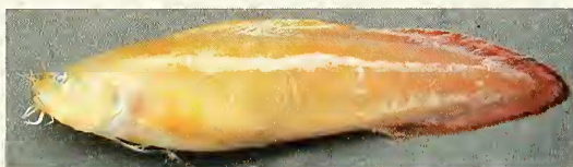
FIGURE 2. Fresh color of holotype (CAS 221531) of Brotula flaviviridis .