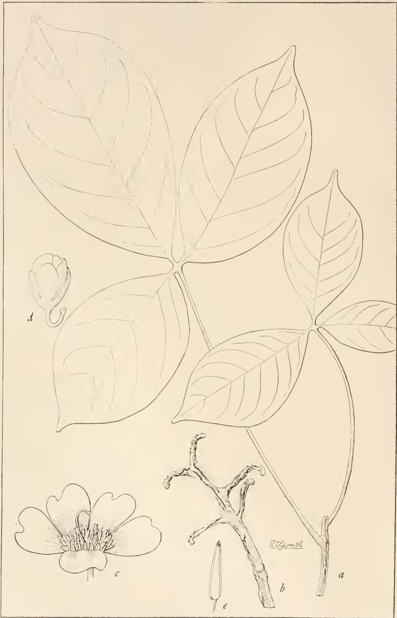
Fig. 1. Maximiliana triphylla Blake. a , leaves, \times \frac{1}{2} ; b , inflorescence after defloration, \times \frac{1}{2} ; c , flower, \times \frac{1}{2} ; d , bud, \times about \frac{1}{2} ; e , stamen, \times 2\frac{1}{2} .