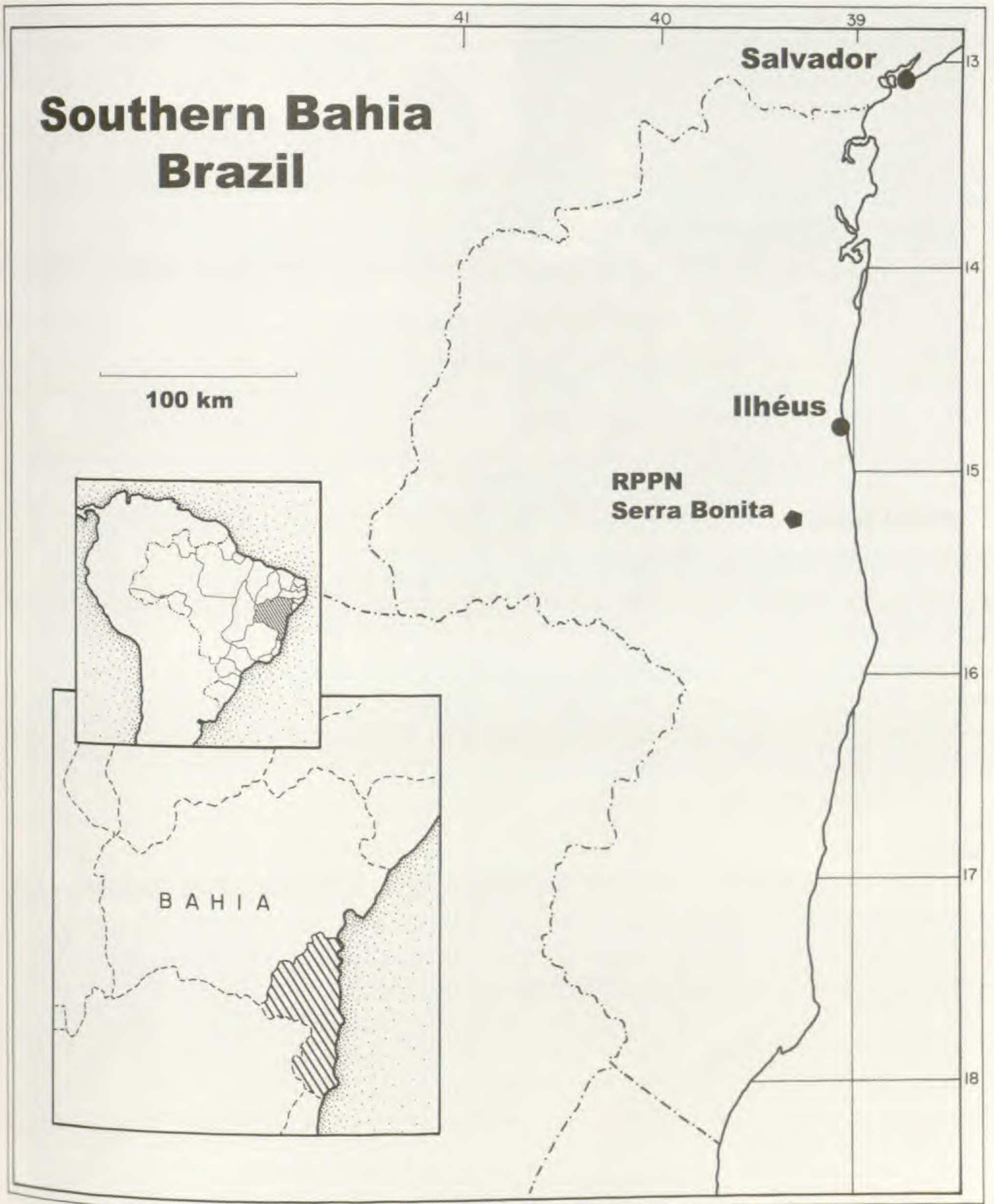
Fig. 1. Serra Bonita Reserve and its location in southern Bahia, Brazil (South America).