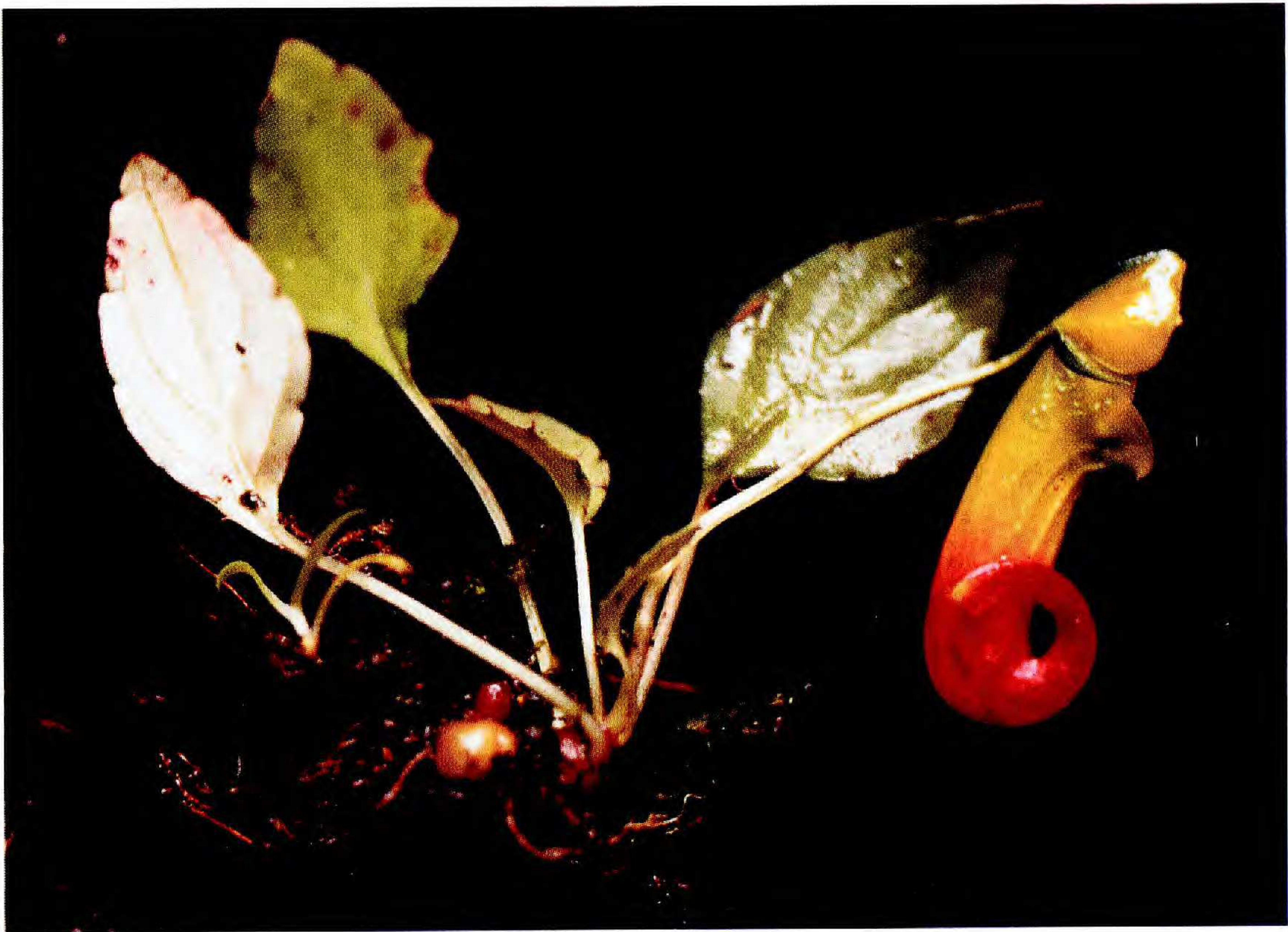
FIG. 2. Impatiens sholayarensis M. Kumar & Sequiera.