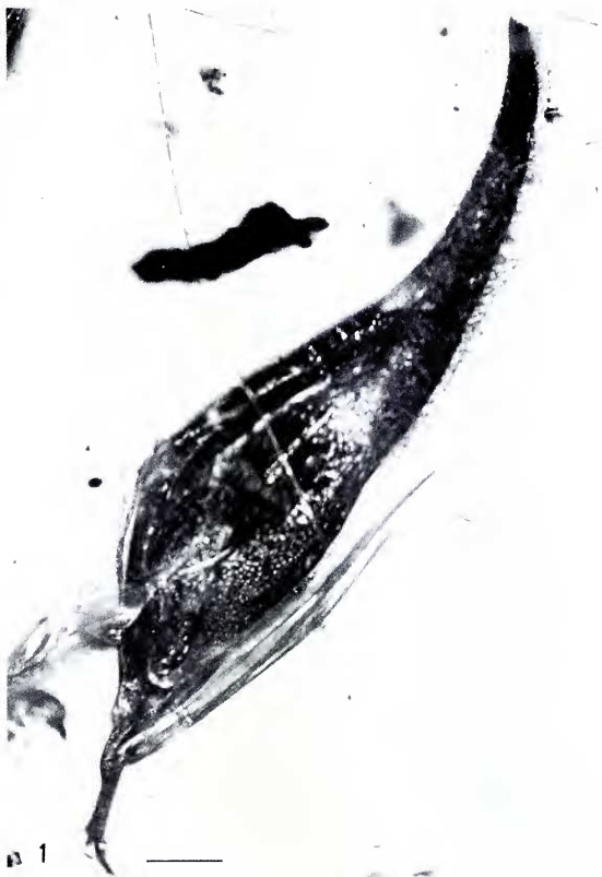
FIG. 1. Spikelet of Pharus primuncinatus in Dominican amber. Bar = 860 \mu m.