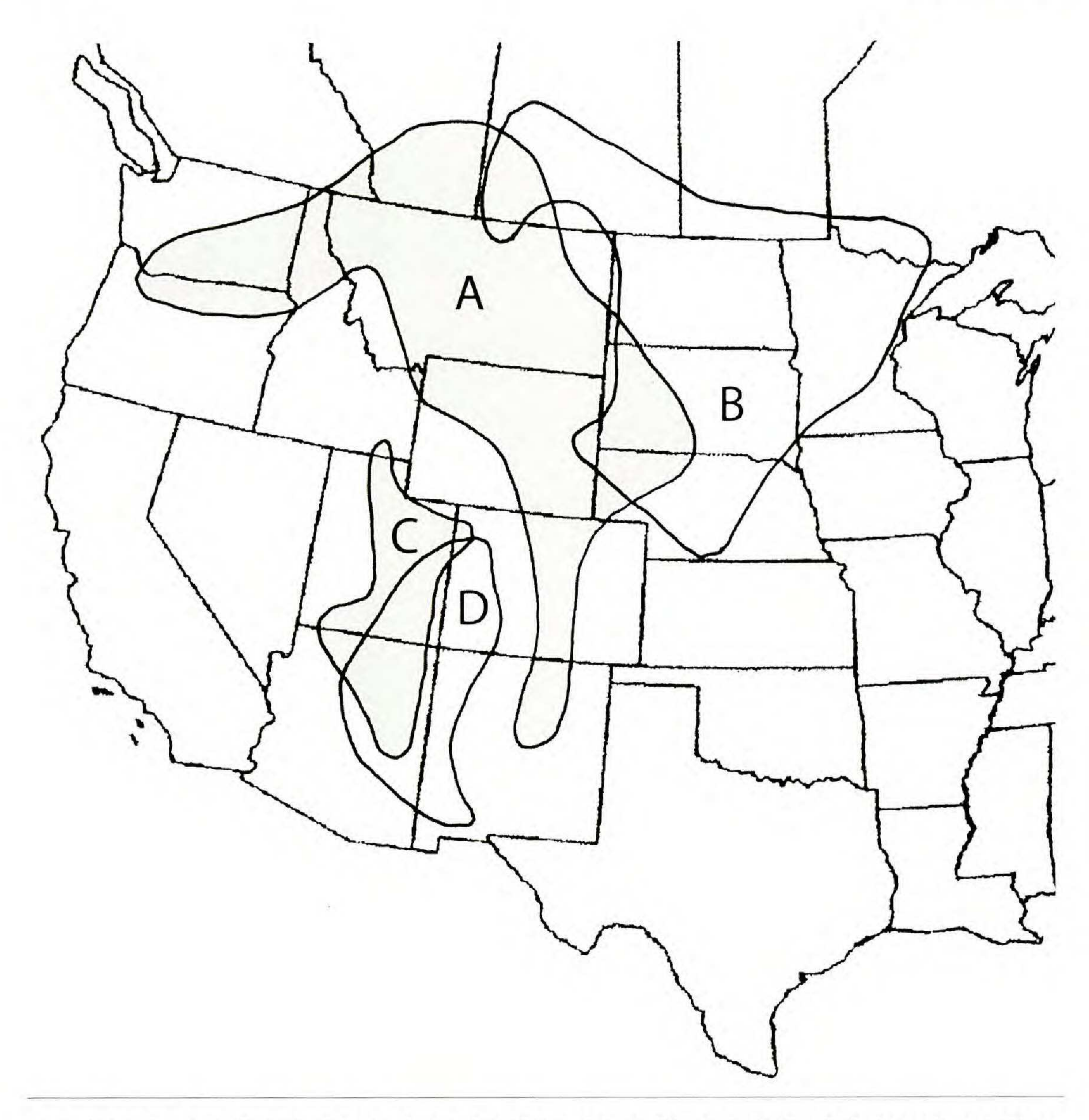
Fig. 2. Generalized distribution of Heterotheca villosa ( A ) var. foliosa , ( B ) var. ballardii , ( C ) H. zionensis , and ( D ) var. pedunculata , all sensu Semple. Compare with Fig. 1 to see broad sympatry of var. foliosa and var. ballardii with var. villosa and var. minor .