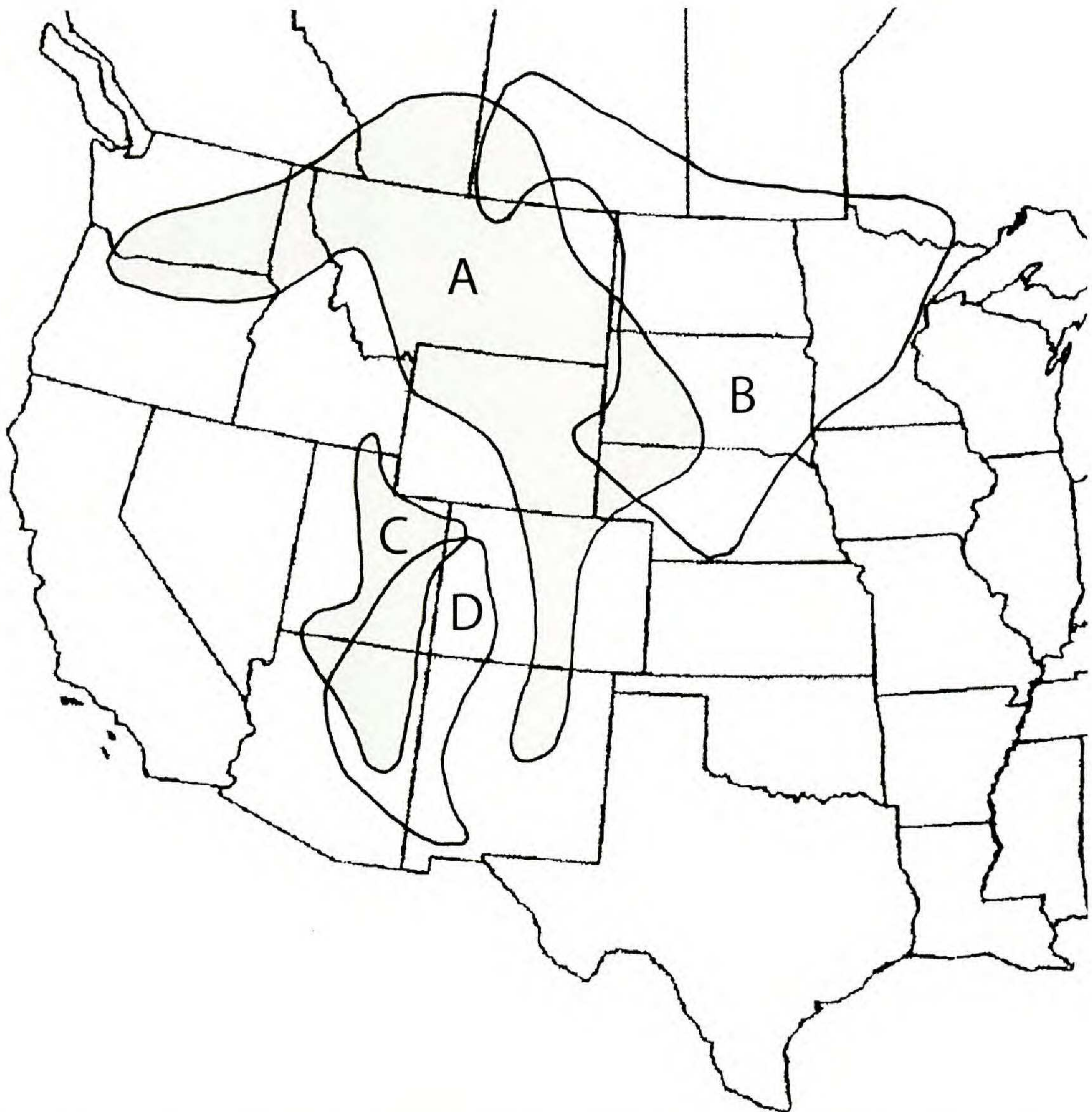
FIG. 2. Generalized distribution of Heterotheca villosa (A) var. foliosa , (B) var. ballardii , (C) H. zionensis , and (D) var. pedunculata , all sensu Semple. Compare with Fig. 1 to see broad sympatry of var. foliosa and var. ballardii with var. villosa and var. minor .