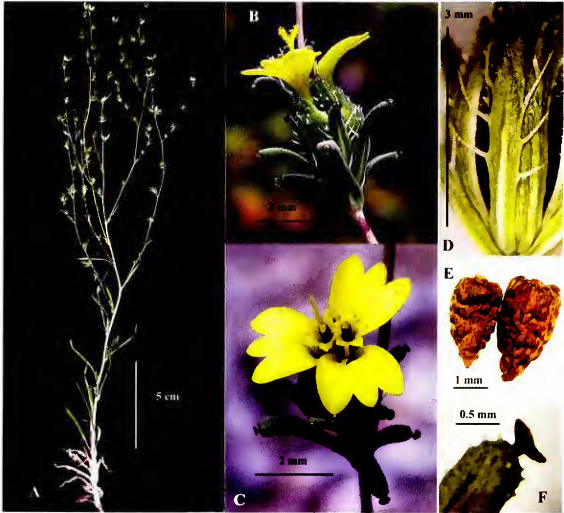
FIG. 1. Calycadenia micrantha . A. Habit. B. Capitulum, lateral view. C. Capitulum from above. D. Peduncular bract (appressed to capitulum). E. Ray cypselae. F. Peduncular bract tip with tack-shaped gland. Photos of Holotype, R.L. Carr 3801 (UC).

terete when developed and tapered toward the base, smooth to very slightly ridged, glabrous, pappi none. Self-compatible. 2n = 14 (Carr 1977).