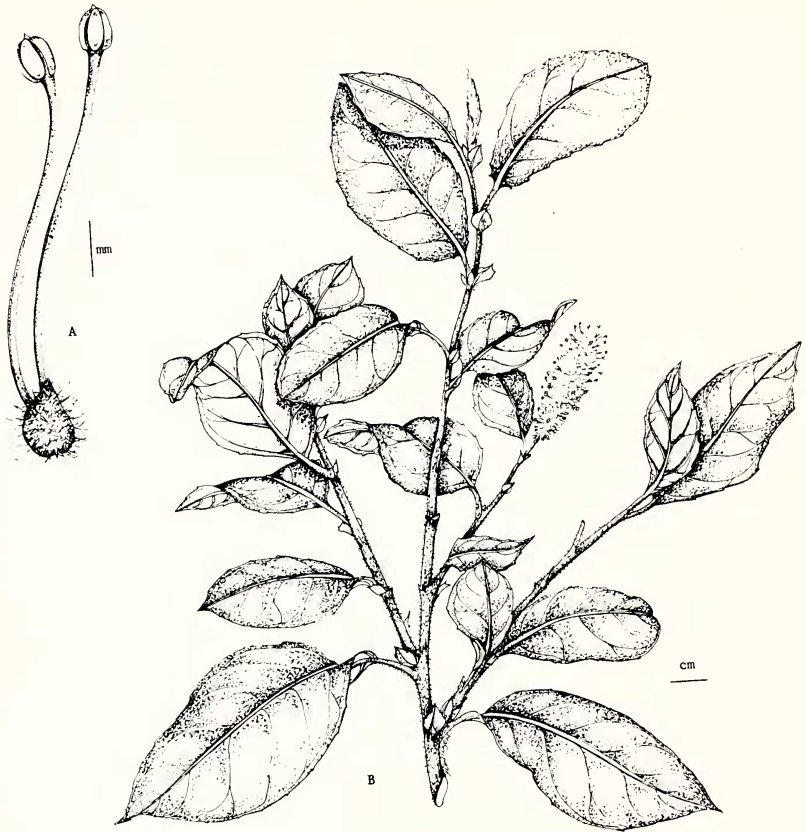
FIG. 3. Salix wendtii M. C. Johnston. A. Staminate flower. B. Twig with leaves and one staminate inflorescence.

“Shrubby trees” to 3 m tall, much branched at base; twigs of the season slender, dark brown, striate, when very young with numerous, spreading, silky, whitish hairs 0.5–1 mm long, later glabrate; internodes ca. 1–2 cm long; axillary buds dark brown, glabrous, 4–6 mm long. Leaf blades ovate-elliptic to elliptic to obovate-elliptic, (4.5–)5–7(–8) cm long, 2–3.5 cm wide, firm, membranous, at margins serrulate with small, antrorse gland-tipped teeth (teeth numerous on rapidly growing shoots, less so elsewhere), at tip weakly cuspidate, at base rounded, on upper surfaces olive-green, essentially glabrous and lustrous at maturity except for white-pubescent midvein, on lower surface waxy-papillose, glaucous and persistently densely canescent-pubescent with antrorse, silky, white hairs 0.5–1 mm long; stomates abundant beneath, absent above; petioles (3–)5–8 mm long, with pubescence