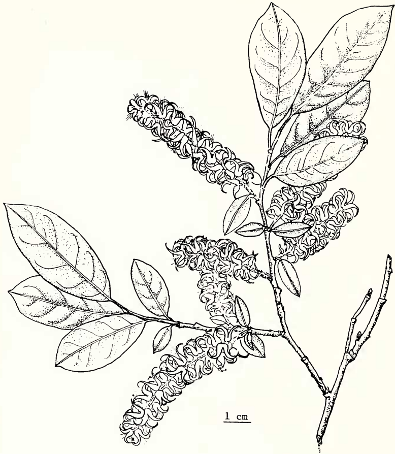
FIG. 2. Salix pattersonii M. C. Johnston. Twig with leaves and pistillate inflorescences.

cence like that of the leaves; stipules minute. Staminate aments unknown. Pistillate aments at anthesis not seen, apparently emerging in May with the leaves, terminating 1-3(-3)-noded 3-5-mm-long axillary ascending-spreading twigs, vastly exceeding twig leaves, cylindric, when in fruit 4-5 cm long, 10-15 mm thick; scales 1.5-2 mm long, lanceolate, acute, appressed, with antrorse, silky, white hairs ca. 1 mm long, less densely hairy on adaxial surface; pedicels ca. 1.6-2 mm long; gland absent; capsule 6-7 mm long, densely hairy with antrorse, silky, white hairs ca. 0.5 mm long, after dehiscence with widely recurved valve-beaks; stigmata ca. 0.3-0.4 mm long, deltoid, about as wide as long. Seeds narrowly falcate-ovoid, compressed, nearly black,