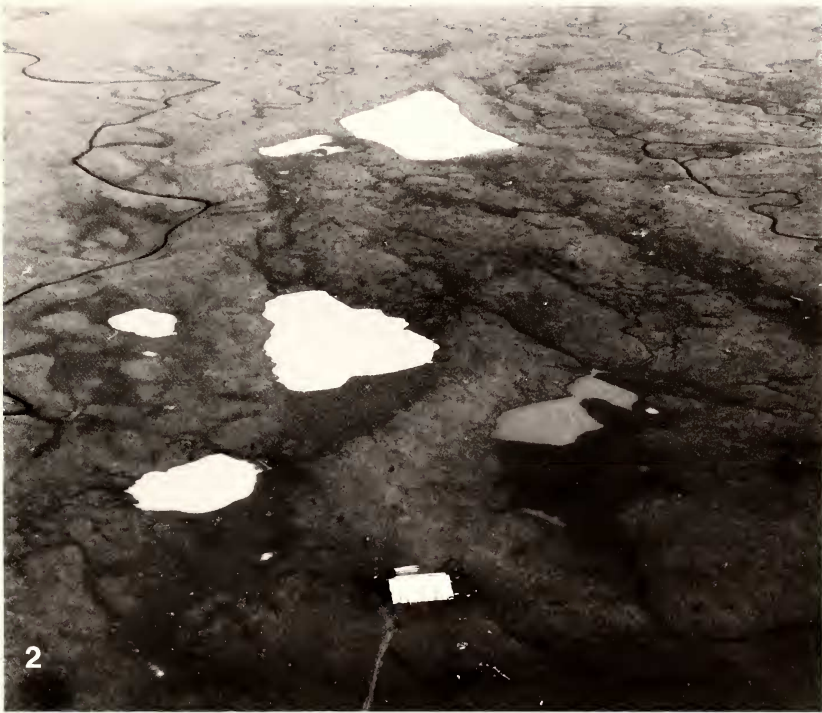
FIG. 2. Aerial view of the Vina Plains Preserve from the south, showing several large vernal pools and a barn located on the access road.

California (Fig. 1). The area is bordered by Tuscan volcanic mudflows of the Cascade Range to the east and the Sacramento River to the west. The elevation is about 66 m, and topographic relief varies by about 4.5 m from north to south. The Wurlitzer addition in 1984 (176 ha) is not included in the present study.