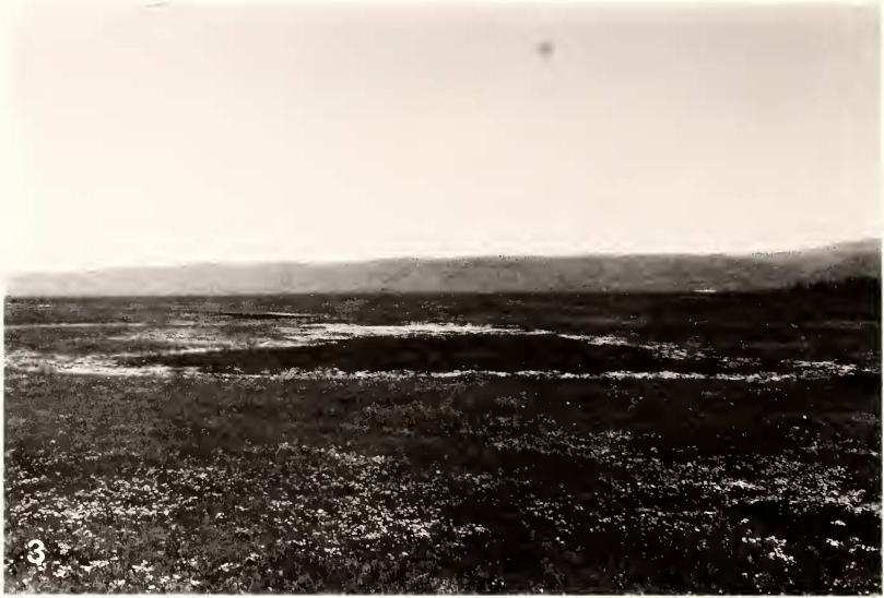
FIG. 3. A large hogwallow that displays "rings" of flowering species. Mt. Lassen is visible in background.

southward to the Vina area (Harwood et al. 1981). This deposit consists of coarse sands and gravels that were transported from the foothills on the northeast and east, deposited in alluvial fans, and cemented. This "fanglomerate" is 1 to 2 million yr old, mainly andesitic and basaltic in composition, and well cemented into rock (conglomerate) by materials in the ground water. At Vina Plains Preserve, the strata are exposed in such places as the waterways and edges of the pools. About 100,000 yr ago, weathering weakened the cement, converting the conglomerate back to sand, silt, and gravel to a variable depth of 2–5 m. Subsequently (10,000–20,000 yr ago) the deposition of silt occurred either by wind or by flooding of the Sacramento River during the period of glacial climate. The fine-grained sediment is evident in isolated mounds. Finally, strong winds associated with a dry climate during the period that ended about 4000 yr ago (known as the altithermal) could have removed much of the silt layer and excavated pools in the weathered fanglomerate. The pools hold water because of the basic, slightly permeable fanglomerate floor, and because of the clay that washed in from the higher surroundings. Milder erosion by gentle runoff could have produced the many gullies that occur naturally.