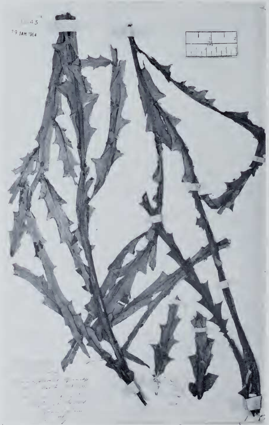
Lectotype of Acacia bossiaeoides A. Cunn. ex Benth.