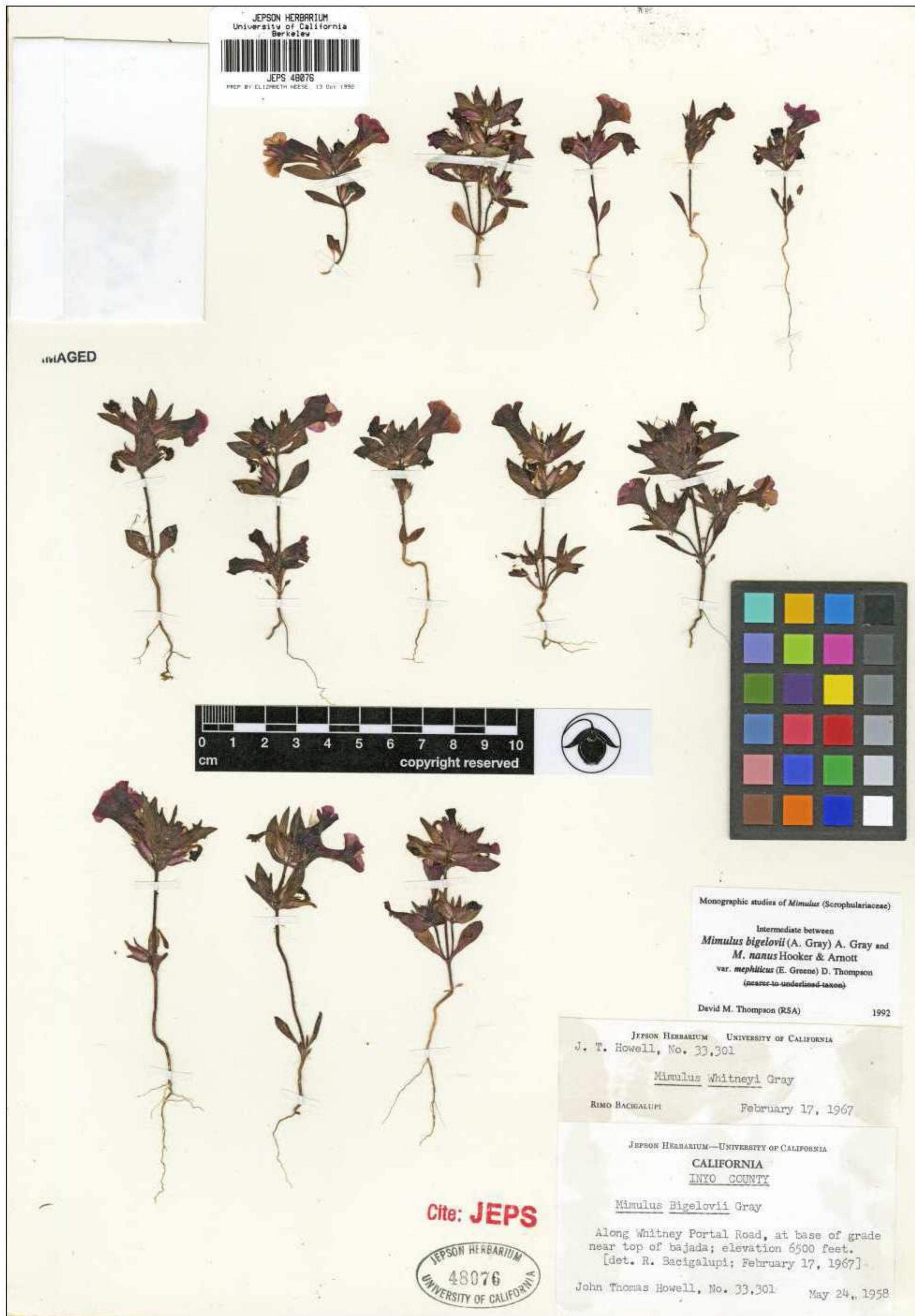
Figure 2. Diplacus thompsonii . Howell 33,301 (JEPS).