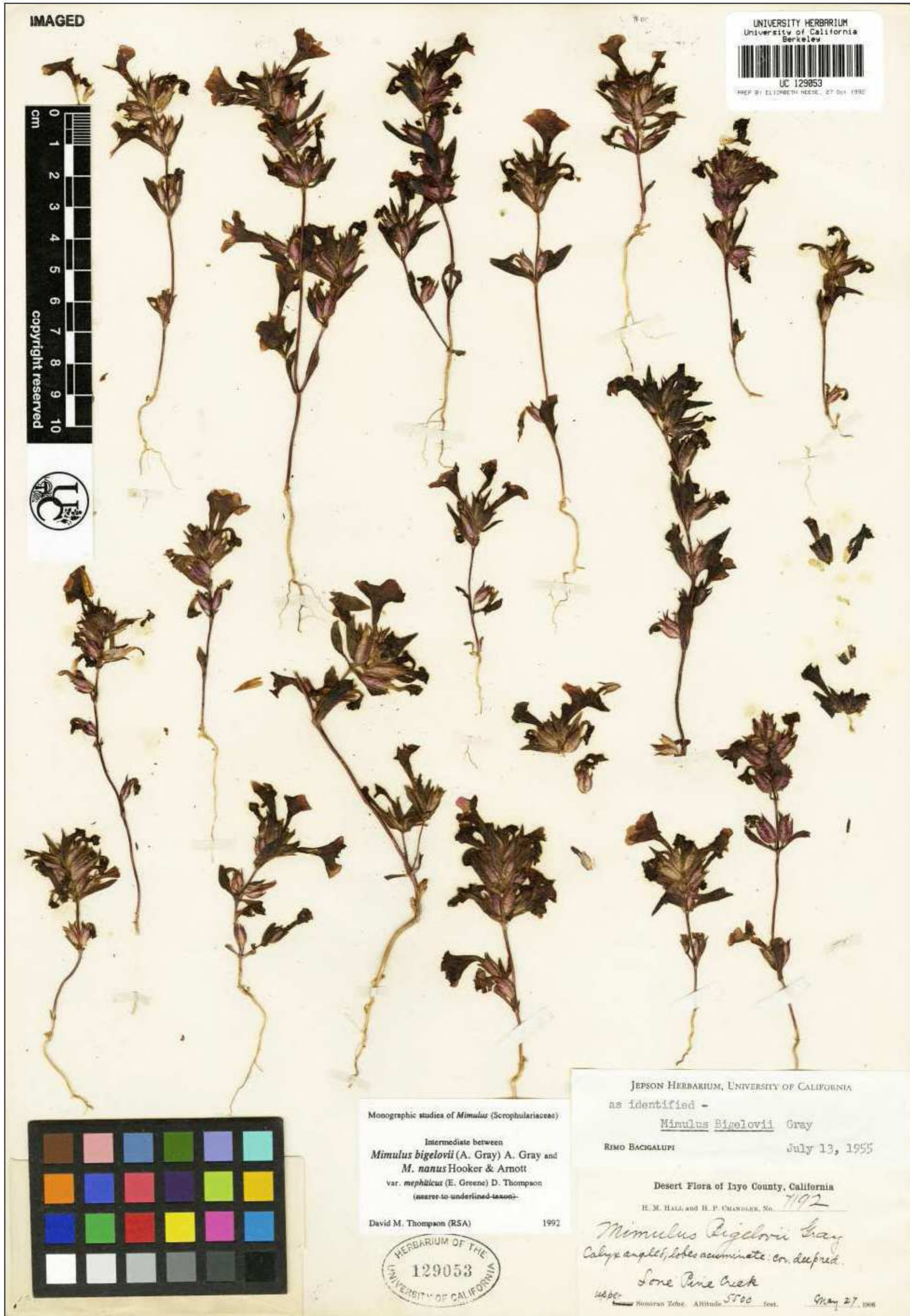
Figure 3. Diplacus thompsonii . Hall and Chandler 7192 (UC).