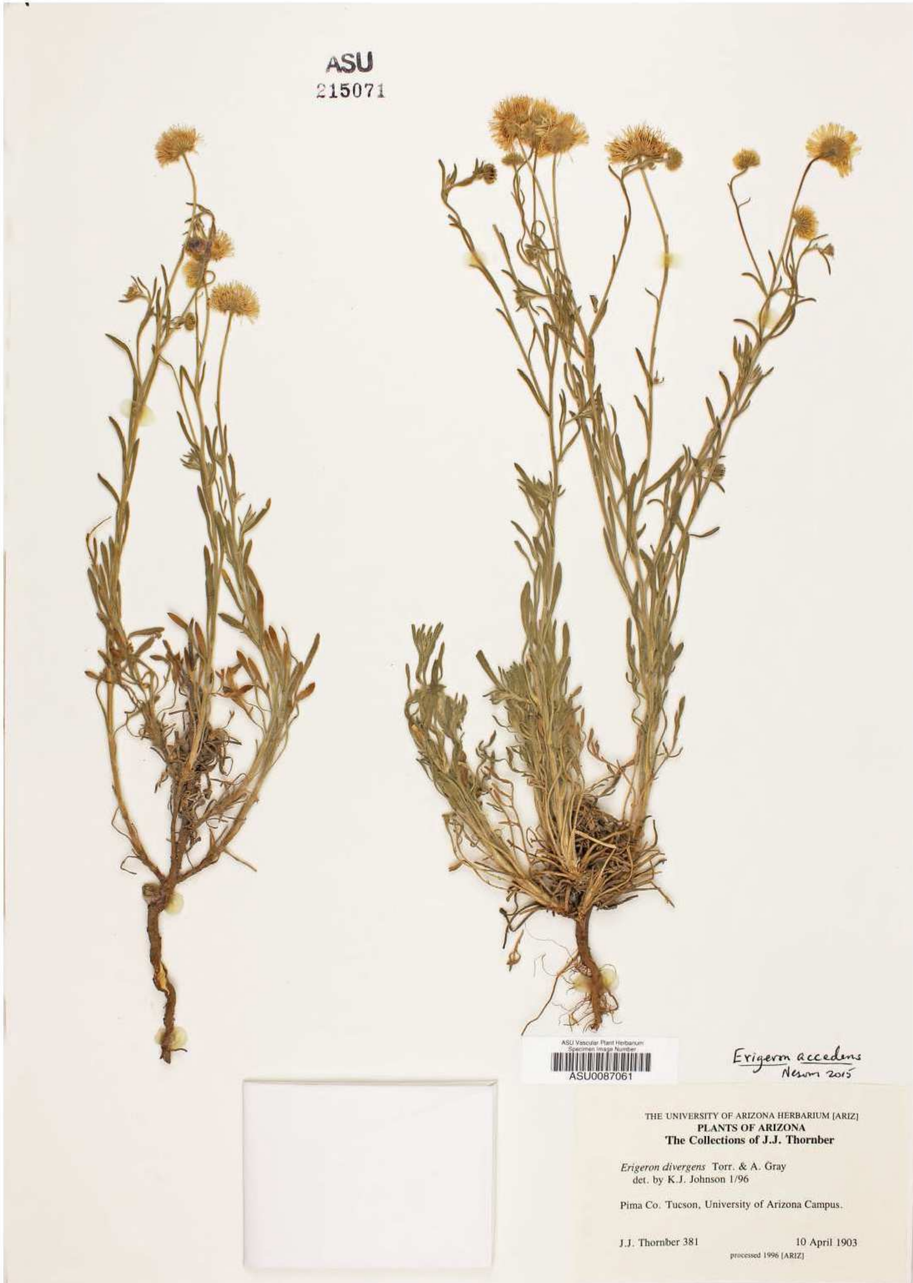
Figure 11. Erigeron incomptus , Pima Co., Arizona.