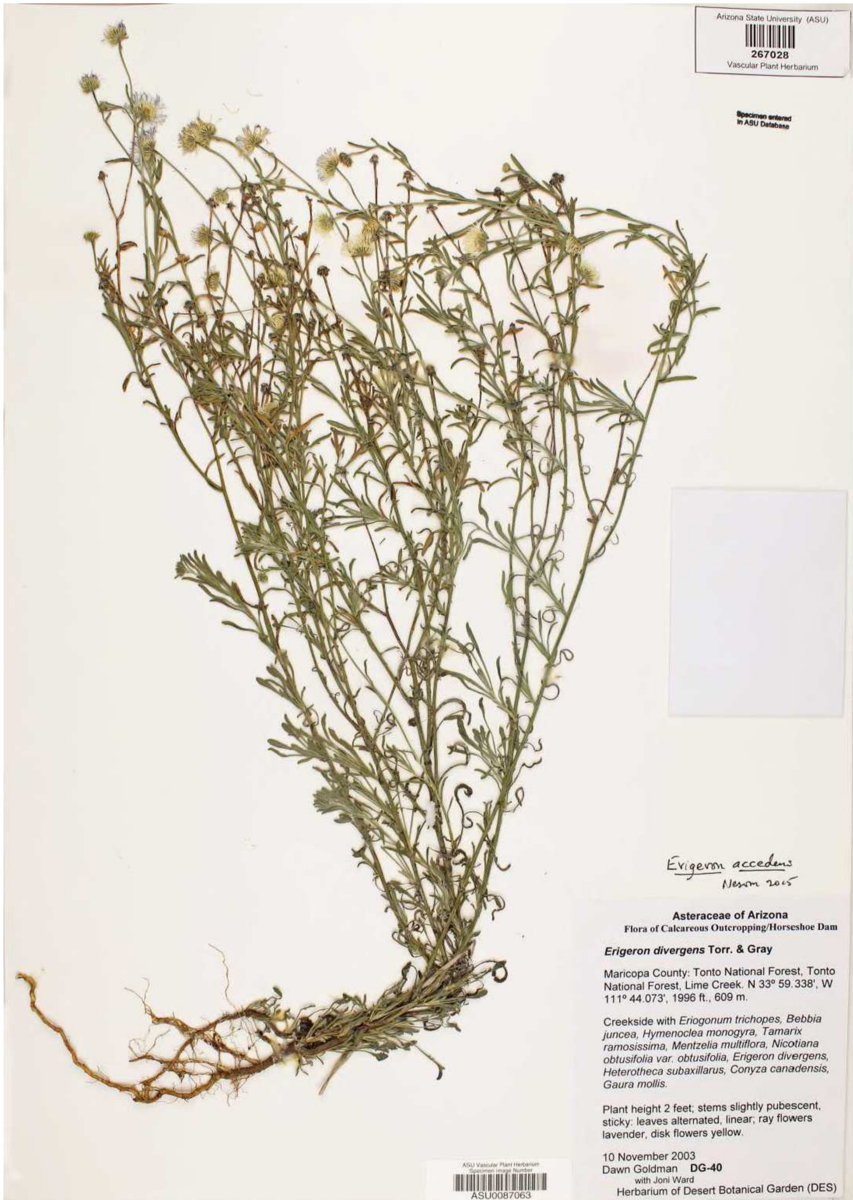
Figure 10. Erigeron incomptus , Maricopa Co., Arizona.