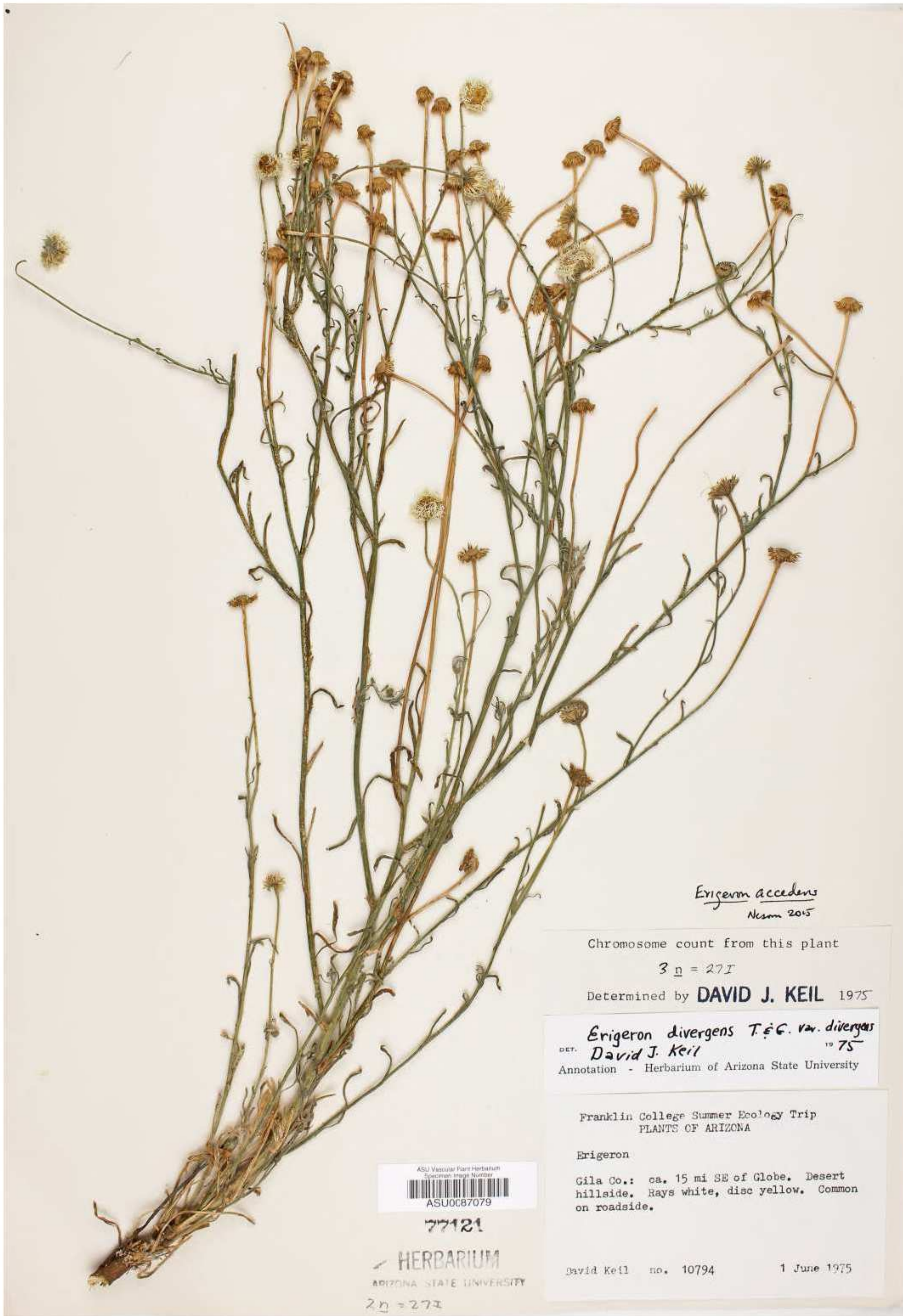
Figure 17. Erigeron incomptus , Gila Co., Arizona. Chromosome number 2n = 27 .