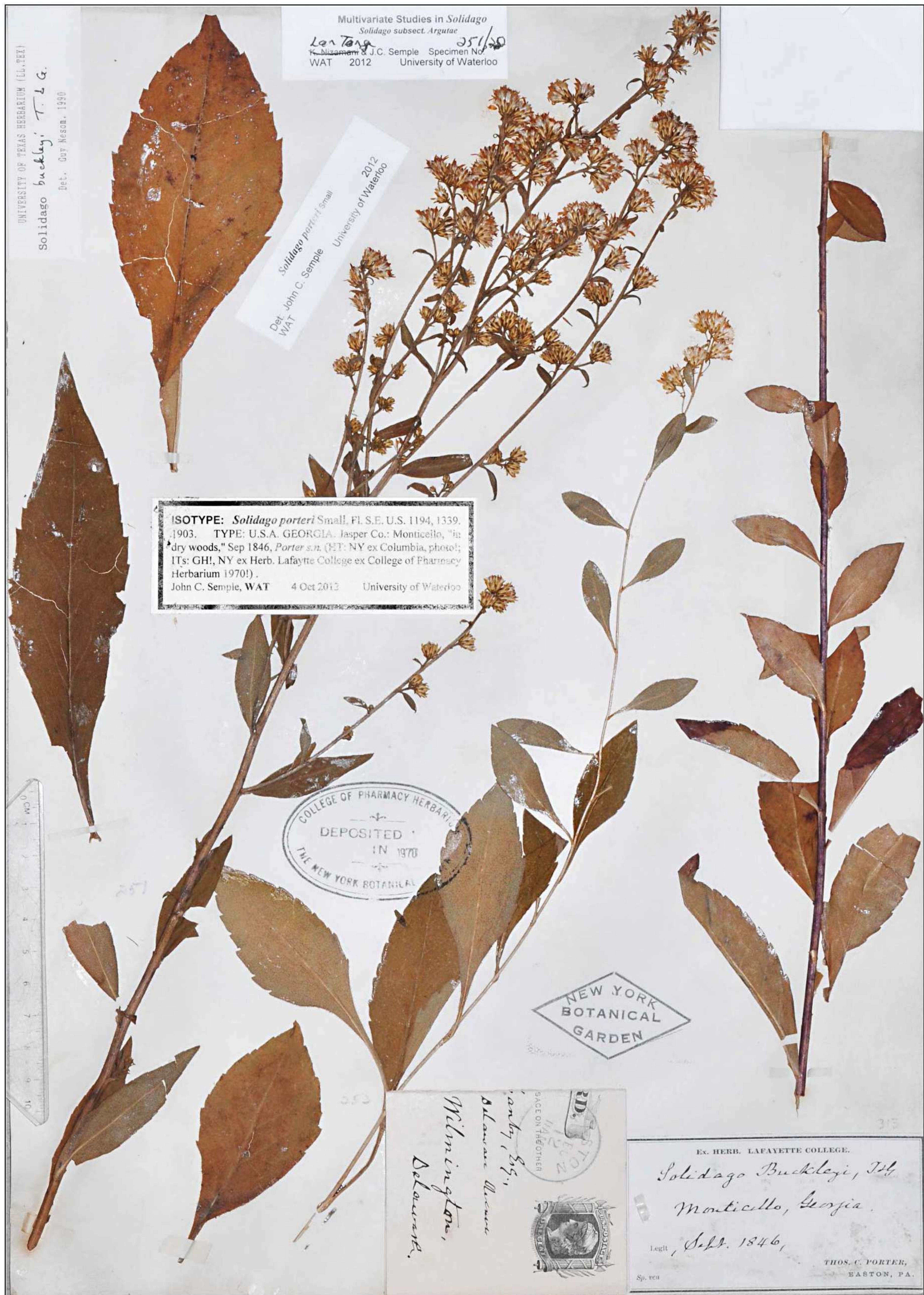
Figure 1. A previously unrecognized isotype of Solidago porteri Small, Porter s.n. (NY).