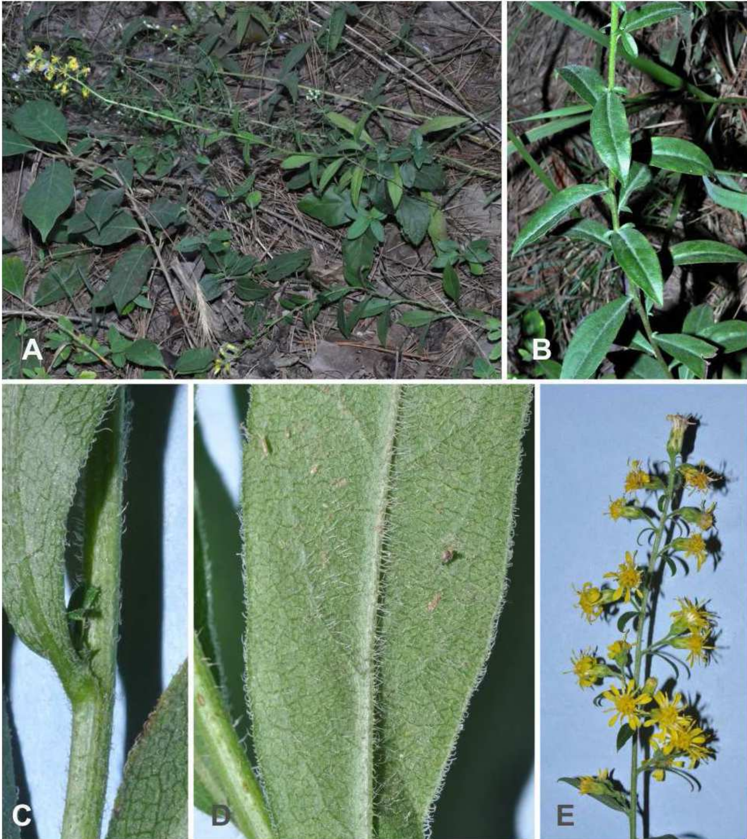
Figure 5. Solidago porteri morphology, Tennessee (Semple et al. 11861). A. Shoots. B. Mid stem leaves. C. Mid stem detail. D. Mid stem leaf detail, abaxial surface. E. Inflorescence.