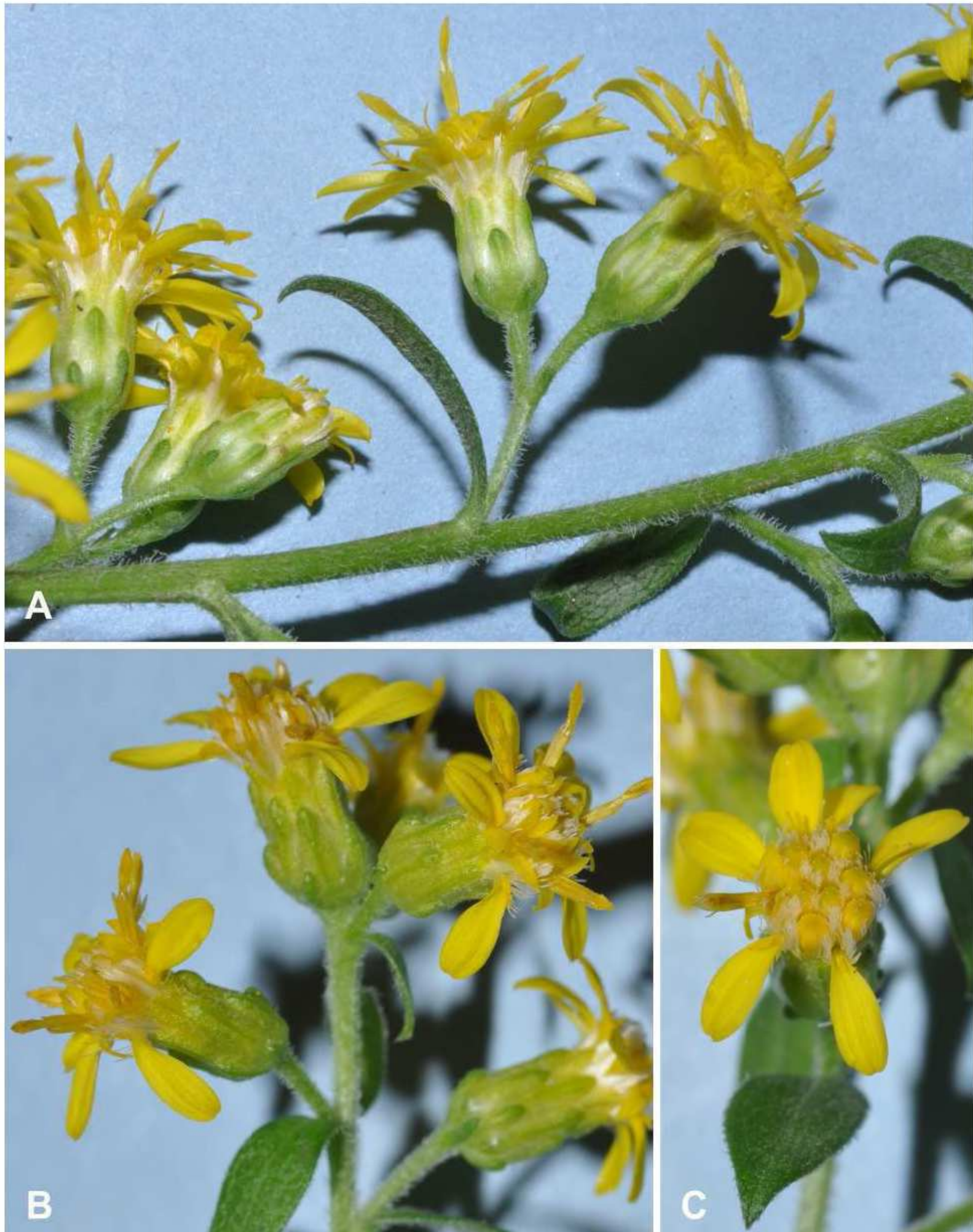
Figure 6. Solidago porteri floral morphology, Tennessee (Semple et al. 11861). A. Part of an inflorescence. B. Heads showing involucre. C. Head showing rays; most disc florets not yet open.