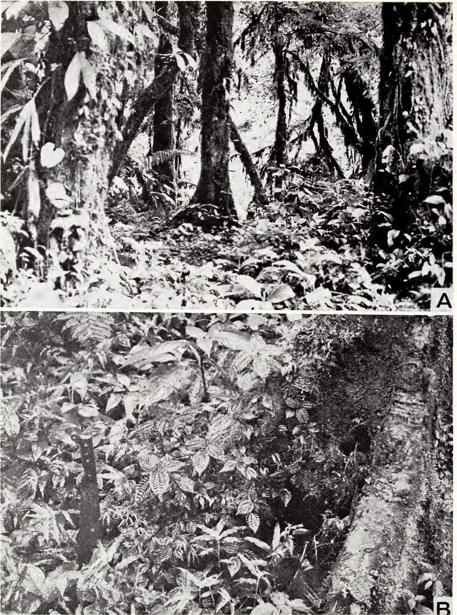
FIG. 2. Habitat selection for oviposition in Phyciodes (Eresia) entropia at Cuesta Angel. (A) Herbaceous understory of the river-bottom forest where the larval food plant is found. (B) Vine growth form of the larval food plant, Pilea pittieri Killip (Urticaceae) at base of canopy tree (the dark red form of the plant is shown).