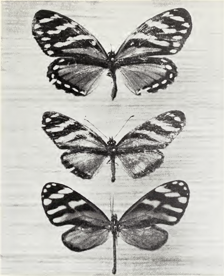
FIG. 4. Probable Batesian mimicry complex involving Phyciodes eutropia at Cuesta Angel. From top to bottom: Female P. eutropia , male P. eutropia , and male Ithomia heraldica heraldica (Ithomiidae). Dorsal aspects of all individuals are shown.

candidate for mimetic interaction is Ithomia heraldica heraldica (Fig. 4) in the Ithomiidae. This species feeds at the same flowers as P. eutropia and generally flies at the same time of day. In the absence of detailed quantitative data on the relative abundances of both species where they occur together and also on the possibly greater interaction of Ithomia with male P. eutropia , it is difficult to conclude that mimicry is operating between them.