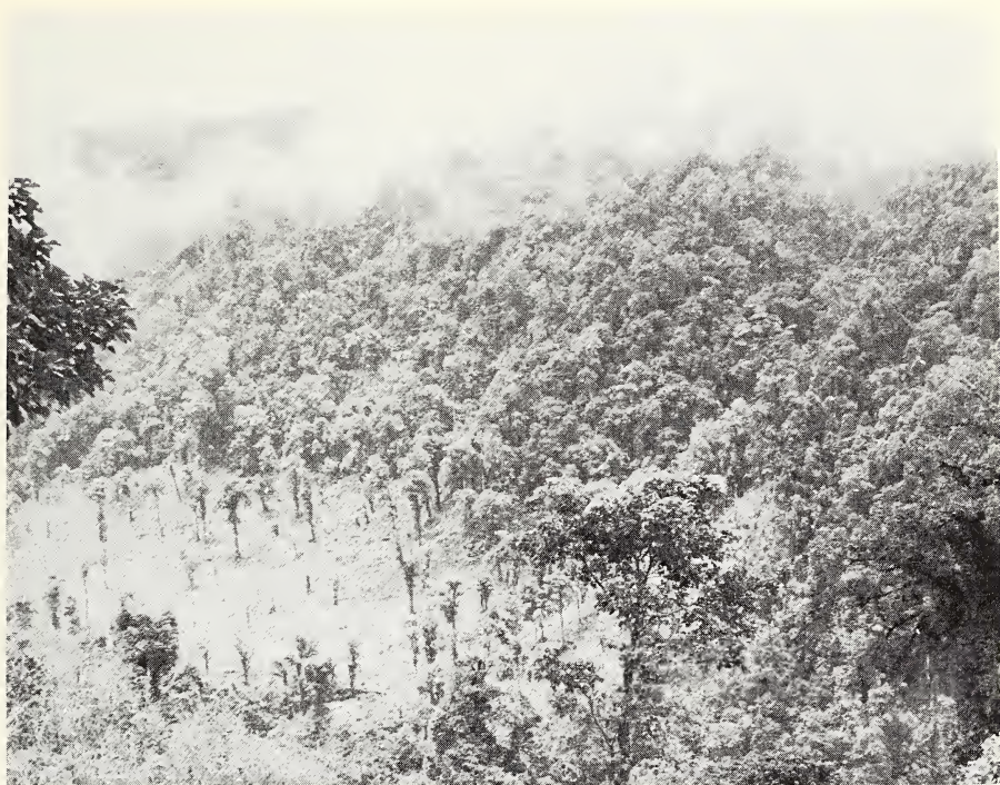
FIG. 1. Overall view of the forest ravine, Cuesta Angel, in the central highlands (Heredia Province) of Costa Rica.

of five days. Both adult habitat preferences and larval food plants were usually examined between 8:30 A.M. and 3:00 P.M., but the actual number of hours spent doing this daily was very irregular.