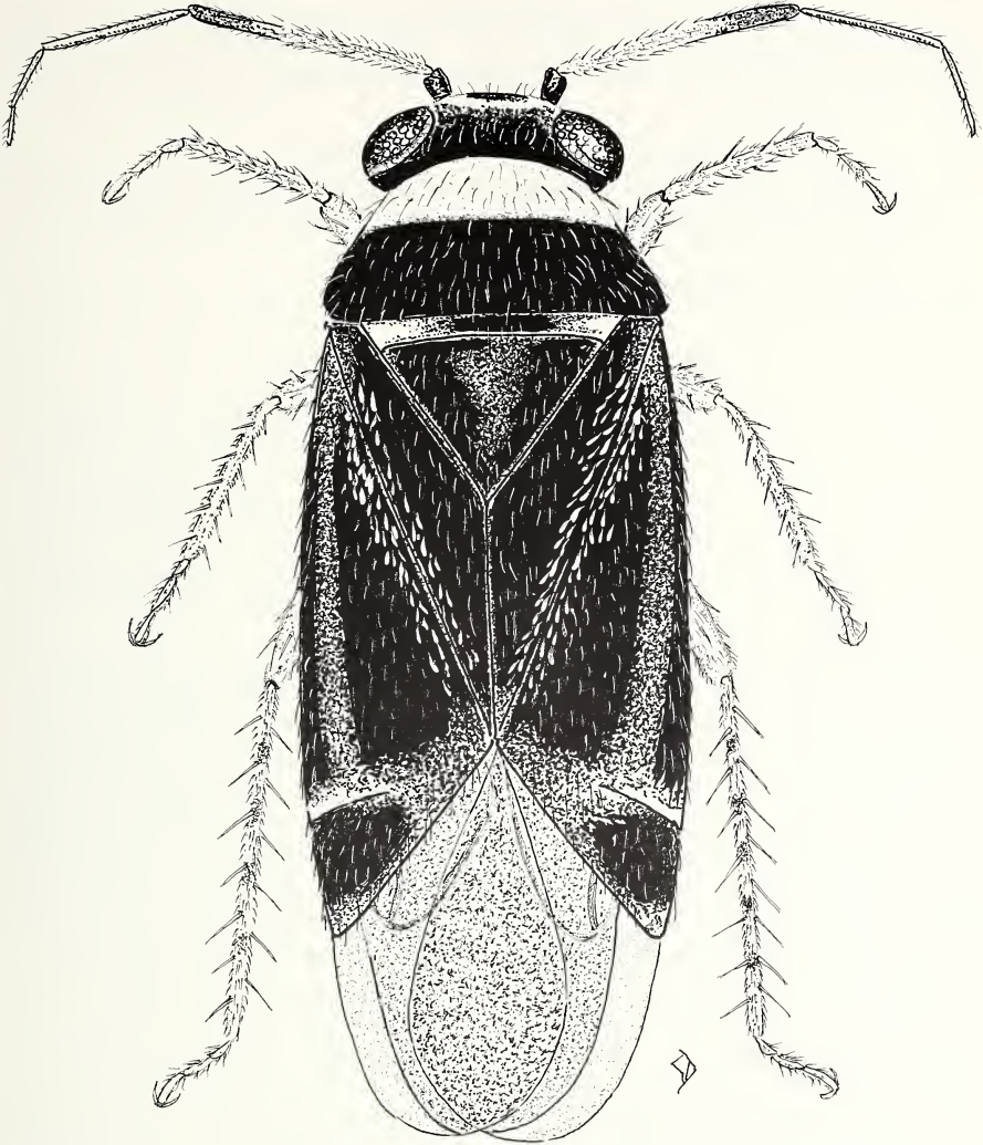
Fig. 9. Atractotomus bicolor , dorsal habitus, male.