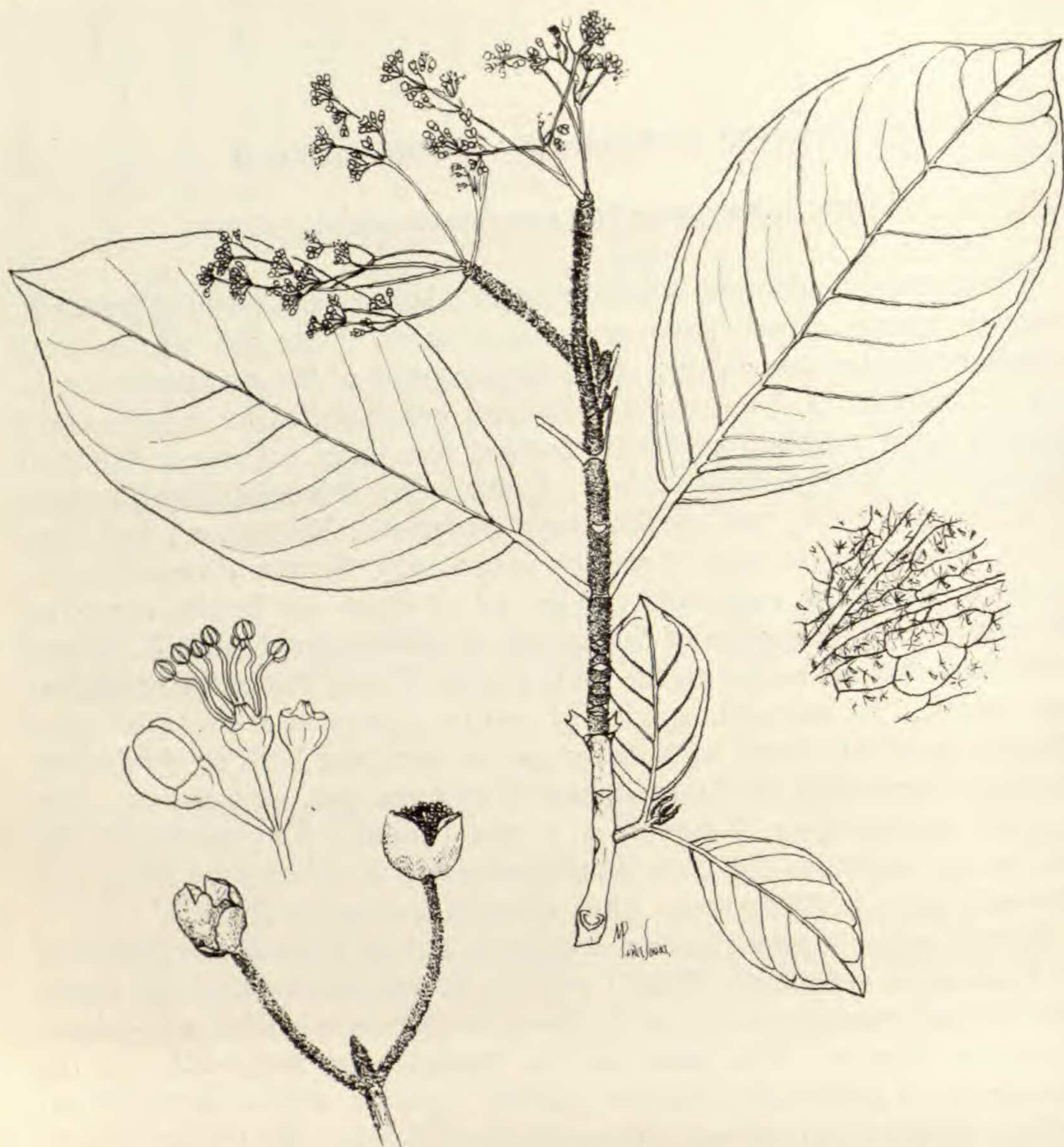
FIG. 1. Hydrangea nebulicola . (Gómez-Pompa 1541). Flowering branch with details of inflorescence and pubescence of lower leaf-surface.

success to search for pistillate specimens. All that we have observed is that the flowering of the species is rare although it may continue over several months. With these considerations in mind and the realization that the species is both rare and dioecious we can understand the importance of vegetative reproduction and its rôle in survival.