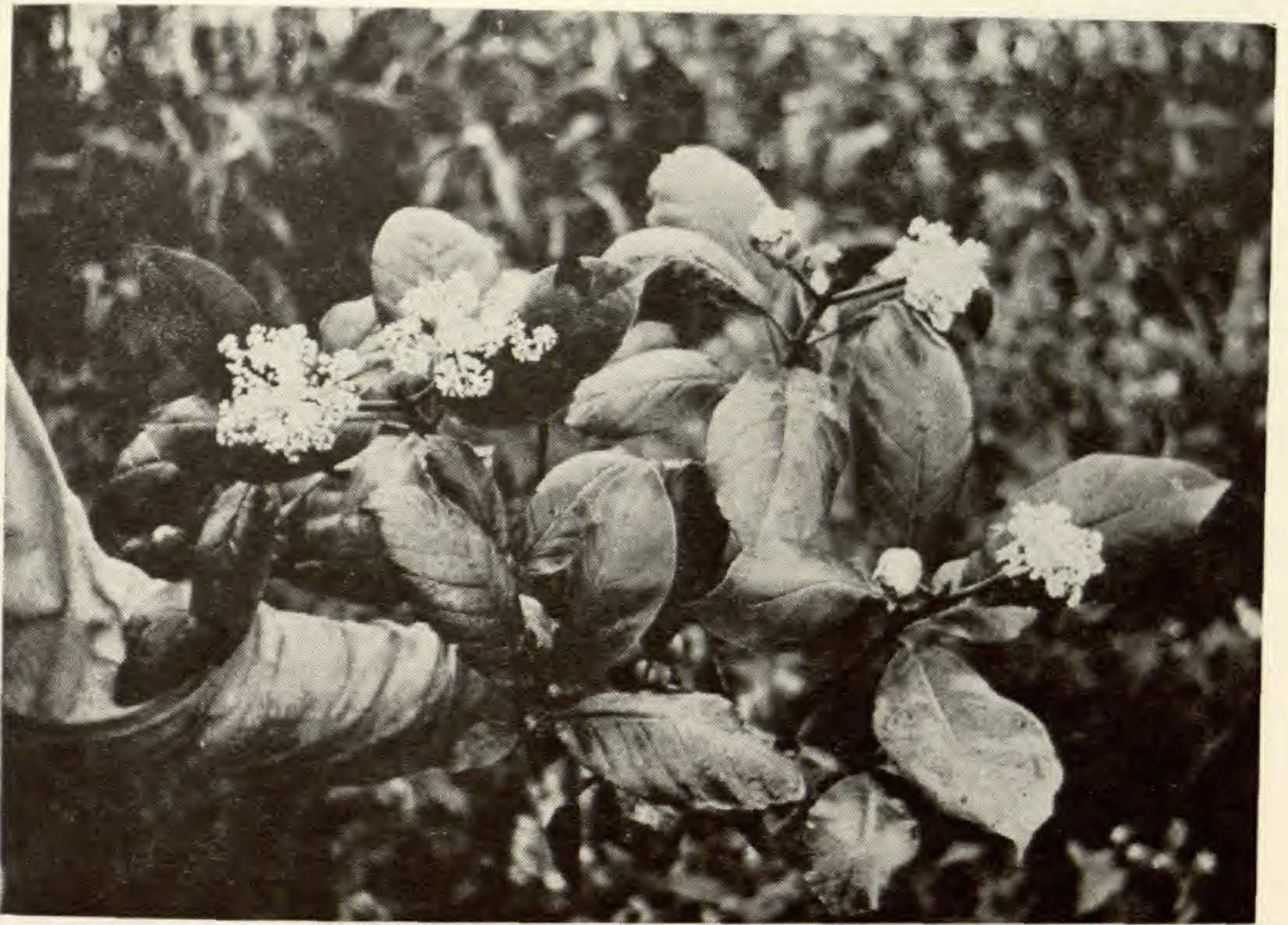
FIG. 2. Flowering branch of Hydrangea nebulicola showing paired inflorescences at anthesis and young inflorescences enclosed by cucullate bracts.

semblance to juvenile shoots was found. These, termed runner-shoots, were discovered along the forest floor, sometimes covered by leaf-litter. They permit a single plant to climb several individual trees simultaneously. Runner-shoots (FIG. 3) were quite common and are characterized morphologically by reduced bract-like deciduous leaves and adventitious roots on the lower and lateral surfaces, similar in external appearance to those found in Hedera helix L. These peculiar shoots seem to be selective as to the substrate tree, for they were found ascending only relatively mature tree trunks, although no selection as to substrate species is obvious. As a runner-shoot begins an ascent the reduced leaves become larger with a few marginal serrations above the middle of the lamina but very soon become similar to the mature leaf in form and size. The climbing shoot (FIG. 3) is characterized by a very marked unequal production of secondary xylem, the mass of the new wood being produced in the direction of the substrate. This apparently permits the continuing production of the adventitious roots necessary for attachment to the substrate. It is believed that detailed comparison of the wood anatomy of climbing vs. non-climbing species of Hydrangea might prove useful in the determination of evolutionary direction within the genus.