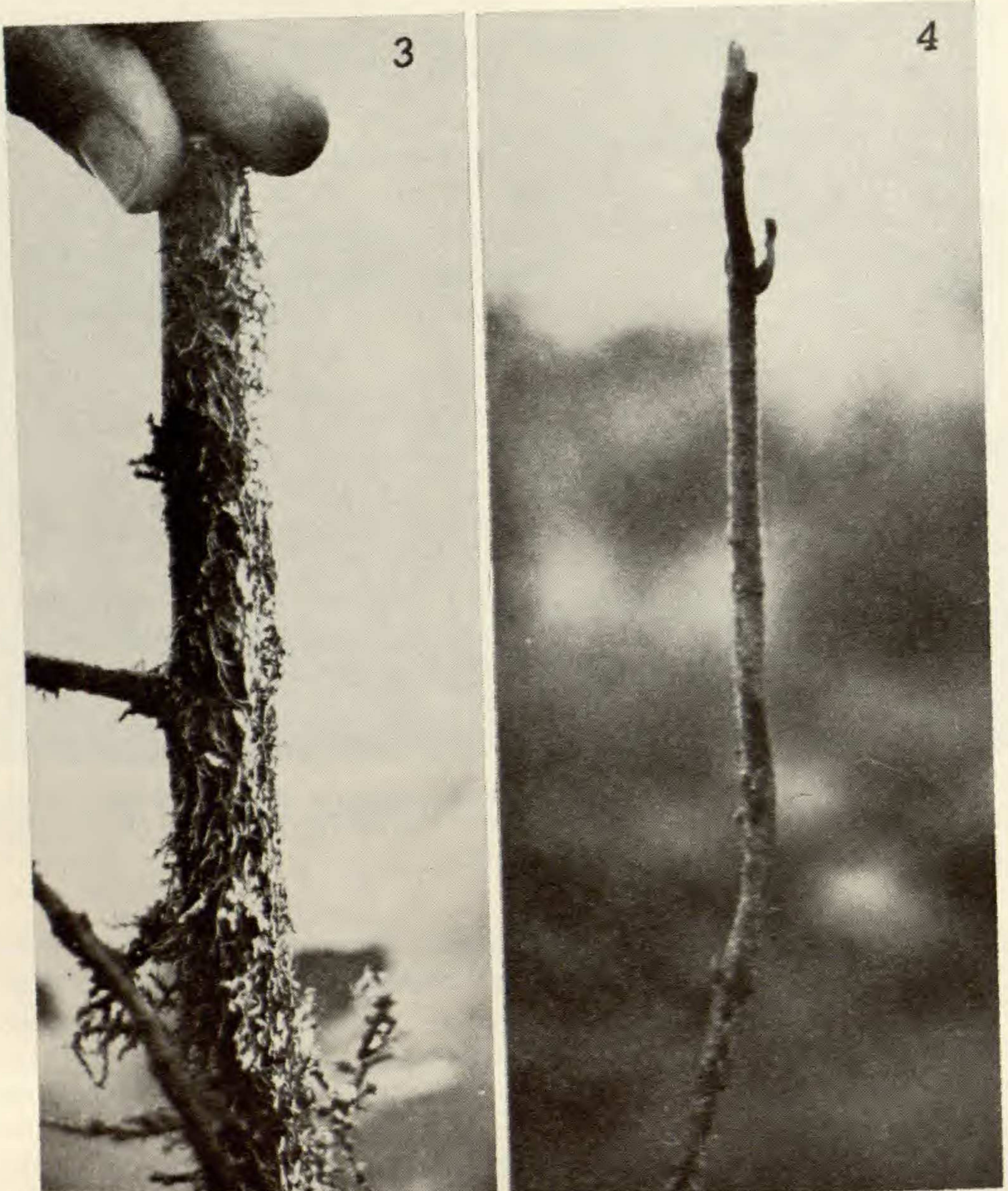
FIG. 3. Young climbing shoot of Hydrangea nebulicola showing side normally appressed to substrate. Note adventitious roots and lateral branches, \times approximately 3/4 .