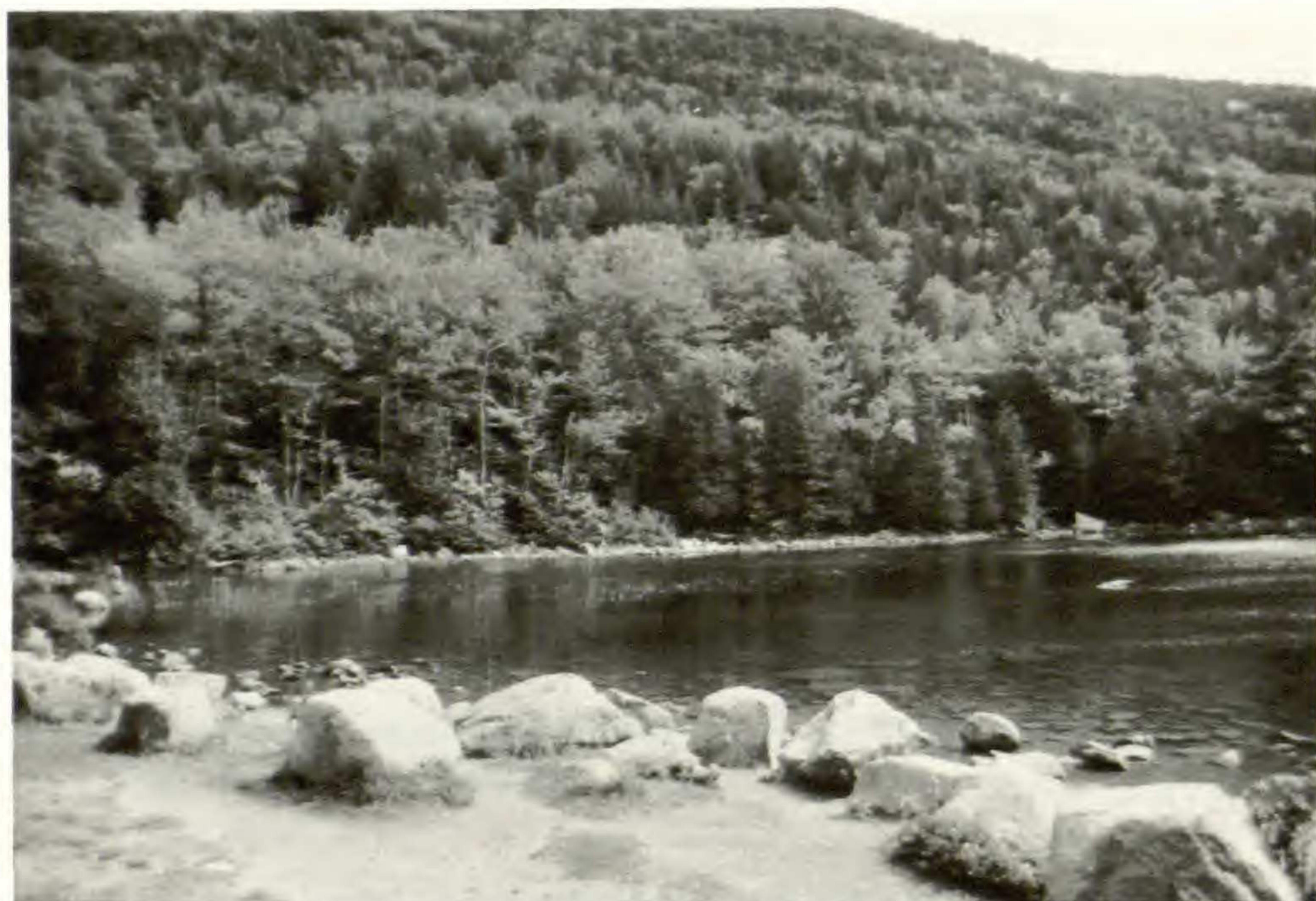
Figure 1. North end of Bubble Pond, Acadia National Park, Maine. Isoetes prototypus is abundant well out from shore, from the point where water depth > 1.5 m is achieved (dark area).

leaves with mahogany-coloured bases and a velum completely covering the sporangium. Megaspores are small ( < 500 \mu\text{m} ) and ornamented by an obscure, reticulate network of low, broad, 'meandiform,' mound-like markings on an essentially smooth surface. These are typical of the megaspores of I. prototypus (Figure 2).