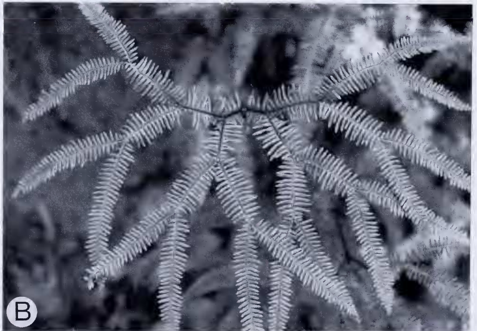
Fig. 2. Photographs of Sticherus pinnae. A Sticherus urceolatus . Note the lanceolate-shaped ultimate branches bearing segments that are obliquely angled. B Sticherus tener . Note the linear-shaped ultimate branches bearing segments which arise at almost right angles to the axis.