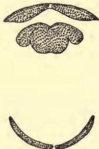
FIG. 32. Teeth of Arius kanganamanensis Herre.

The breadth of the head is 1.37 times in its own length. The mouth is wide with thin lips and a thickened fold at the angles, the upper lip projecting very slightly, the teeth not visible when the mouth is shut. The upper teeth are small, slender, needle-pointed, in an arcuate band of about 5 or 6 rows, widest posteriorly and divided into right and left halves by a narrow interspace at the apex. The teeth of the lower jaw are in a narrower and more arched band,