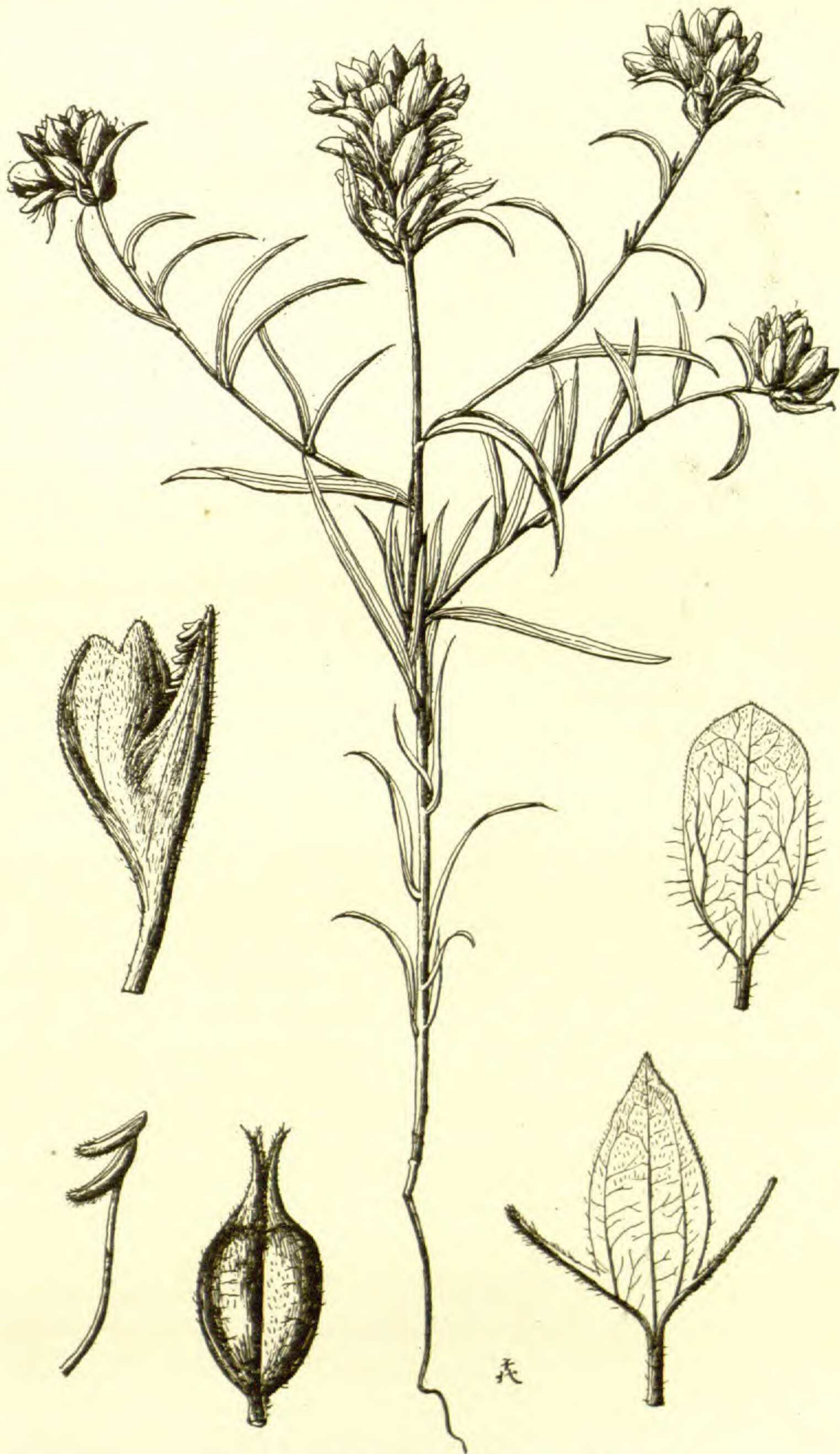
FIG. 1.— Orthocarpus Copelandi Eastw.