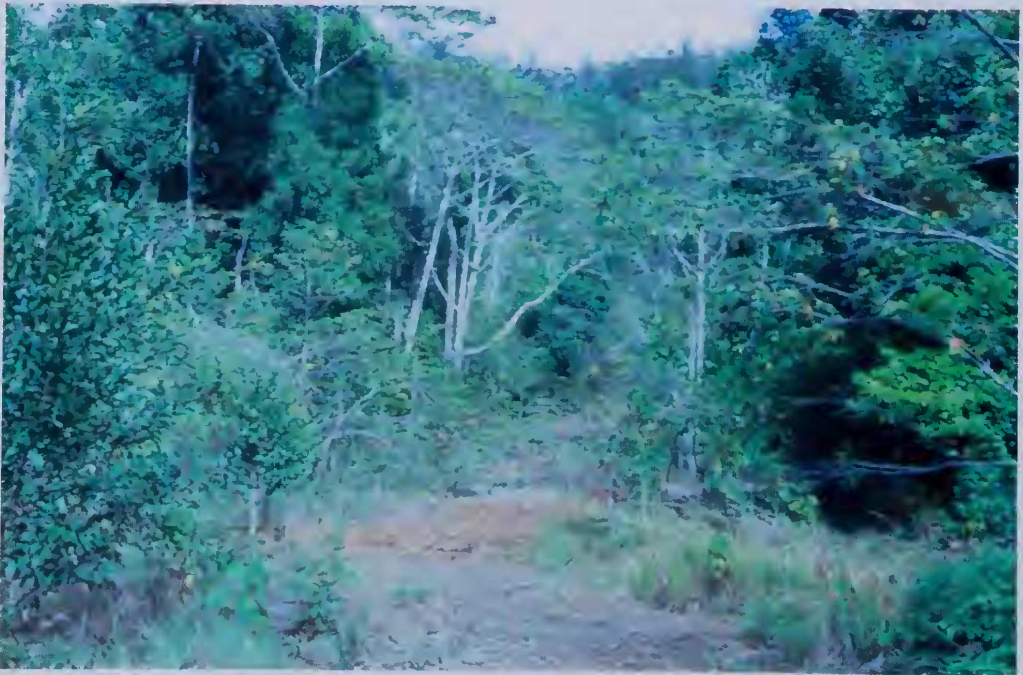
Figure 5 Disturbed volcanic forest along track to Turtle Beach.

Gag Island has a tropical monsoon type climate, characterised by year-round moderate temperatures and high relative humidity. Its climate is influenced by the south-east trade winds from May to October and the north-west monsoons from December to April. The wet season (north-west monsoon) begins in October, peaks in December-January and may continue until April. Mean daily temperatures vary between about 21° and 34° C.