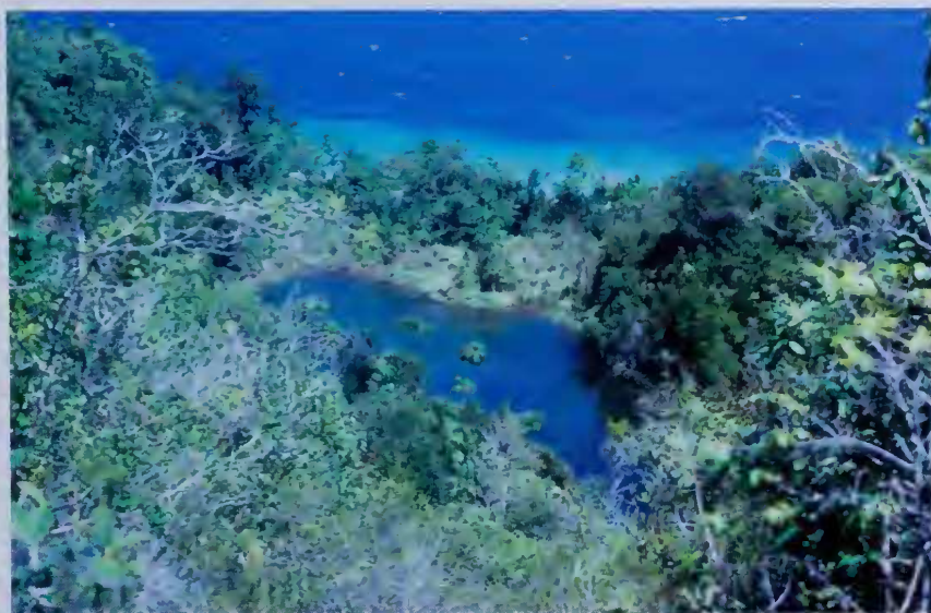
Figure 7 Lagoon, south-west corner of island.