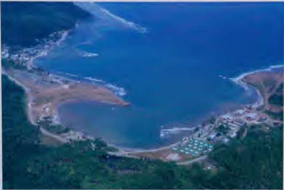
Figure 2 Gambir Bay, with BHP Camp on right and village backed by kebun on left.