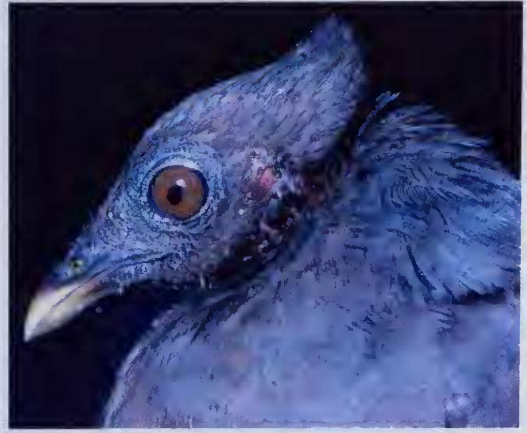
Figure 8 Dusky Scrubfowl Megapodius f. freycinet .

Common to very common. Mainly ones and twos occasionally small groups (up to five). Most numerous in beach vegetation especially on north end of island; also disturbed volcanic forest;