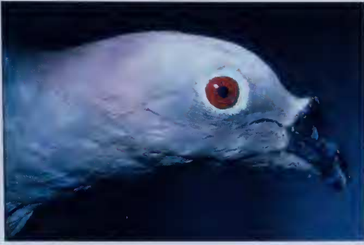
Figure 9 Spice Imperial Pigeon Ducula myristicivora .

eight). Mainly primary volcanic forest, disturbed volcanic forest, ultrabasic valley forest and tall beach vegetation; less frequently in kebun and mangrove forest. Mostly seen feeding in the canopy on fruits and berries. Often observed perched on high bare branches or in powerful direct flight above the forest. Voice a loud guttural 'urwoow'.