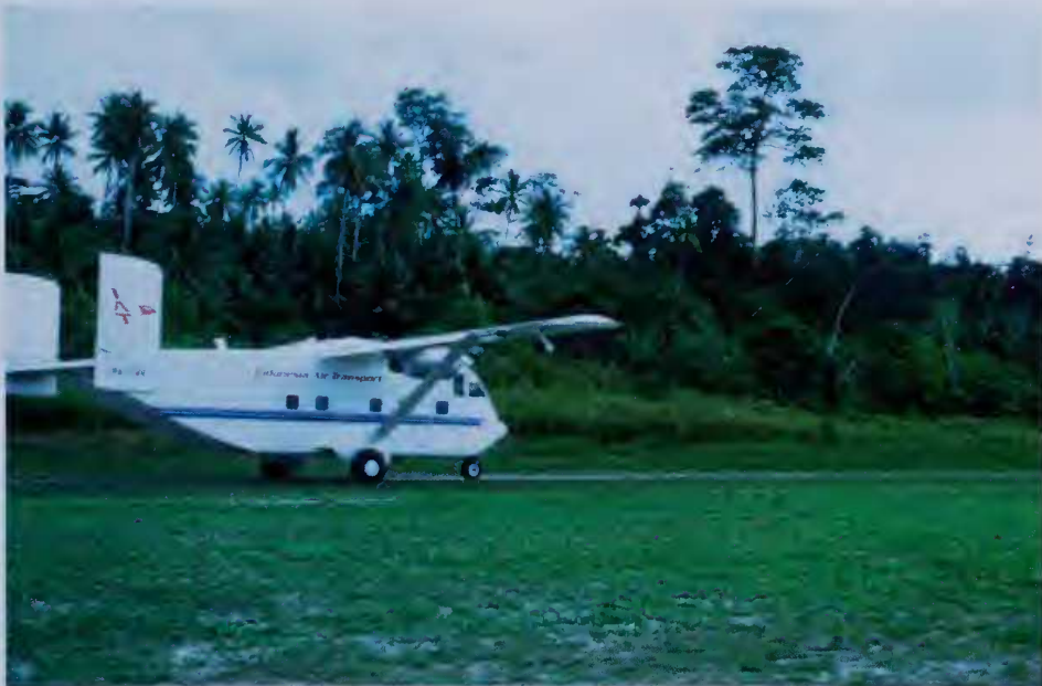
Figure 3 Airstrip with rank herbage and kebun.