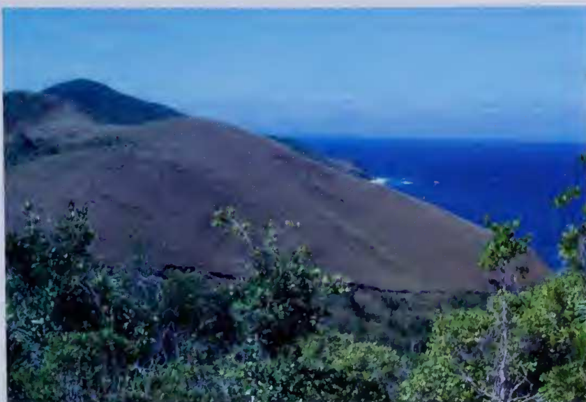
Figure 6 Grassland of Alang alang south of Camp 2.