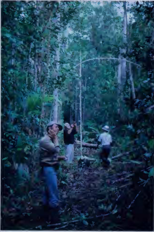
Figure 4 Rainforest near pit 8.