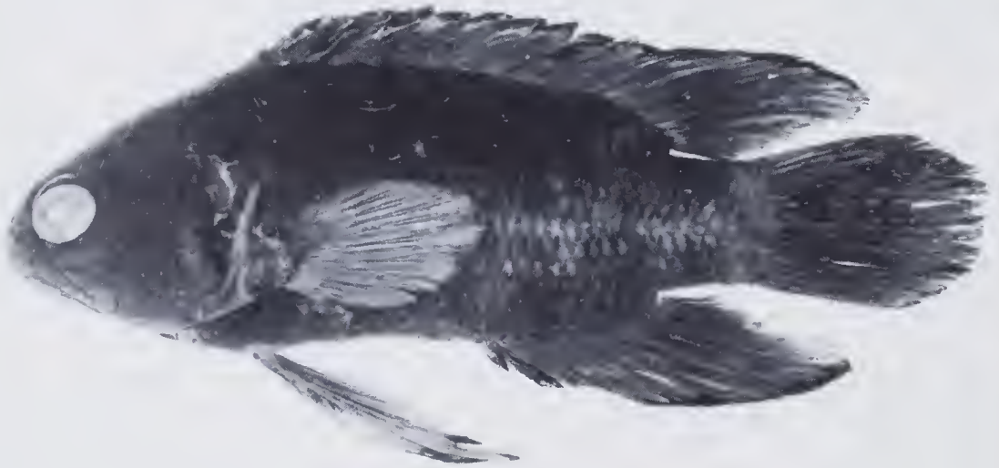
Figure 1 Paraplesiops sinclairi , holotype, 108 mm SL.

Colour of holotype in alcohol: generally similar to fresh coloration, but all blue markings black. The paratypes are similarly coloured, with the exception of the smallest specimen. After many years in preservative, it is now dark brown overall with a few dark spots on the head. The large blackish blotch on the preoperculum is particularly prominent.