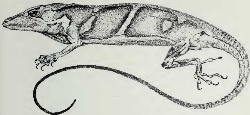
Fig. 1. Lateral view of adult female Anolis fowleri (ASFS V31584).

diagonal (posterior to anterior) tan stripes or bars which are connected ventrolaterally by a longitudinal brown-to-tan stripe, or (2) brown with the above pattern paler brown or tan in contrast to the dark ground color (fig. 1); juveniles patterned like females; both sexes and juveniles with a prominent pale lateronuchal blotch; dewlap brown centrally, yellow peripherally in males, rich chocolate brown in females; iris blue-green in adults.