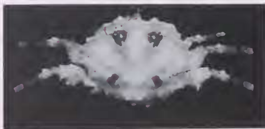
FIG. 2. Exopalicus maculatus (Edmondson, 1930), ♂ (QMW25171) showing pattern of live colouration.

MATERIAL. North West Shelf, Western Australia, CSIRO, RV Soela (64 stations between 19°03.0'S, 119°02.4'E and 20°01.2'S, 116°57.6'E, 36-82m depth, epibenthic sledge or beam trawl, from 8.12.1982 to 30.10.1983): QMW25123, 2 juv. ♀; QMW25134, ♂; QMW25110, 2 ♀; QMW25126, ♂; QMW25144, 2 ♂; QMW25138, juv. ♀; QMW25139, 2 ♂; QMW25116, ♂; QMW25146, ♂; QMW25115, ♀; QMW25124, juv. ♀; QMW25133, ♂; QMW25127, ♀; QMW25156, 2 ♀; QMW25160, unsexed juv.; QMW25125, ♀; QMW25154, 2 ♀; QMW25132, ♂; QMW25166, ♀; QMW25129, juv. ♀; QMW25155, 2 juv. ♀; QMW25162, ♂; QMW25111, ♂ ♀; QMW25147, ♂ incomplete specimen; QMW25114, ♂ ♀; QMW25117, 7 ♂ 3 ♀ juv. ♀; QMW25141, ♂ 2 unsexed juv.; QMW25135, juv. ♀; QMW25140, ♀; QMW25131, juv. ♀; QMW25106, ♂ 2 ♀; QMW25158, ♂ 2 ♀; QMW25145, ♂; QMW25163, ♂ 3 juv.; QMW25120, juv. ♀; QMW25130, juv. ♀; QMW25157, 3 ♀ juv. ♀ 2 unsexed juv.; QMW25159, ♂ 2 ♀; QMW25148, ♂ 5 unsexed juv., 2 incomplete specimens; QMW25165, juv. ♂ 2 ♀; QMW25152, damaged specimen; QMW25167, 2 ♀; QMW25128, 3 ♀; QMW25108, 2 ♂ 3 ♀ 5 juv. ♀; QMW25164, ♂ 2 juv.; QMW25161, ♂ 2 juv. ♀ 15