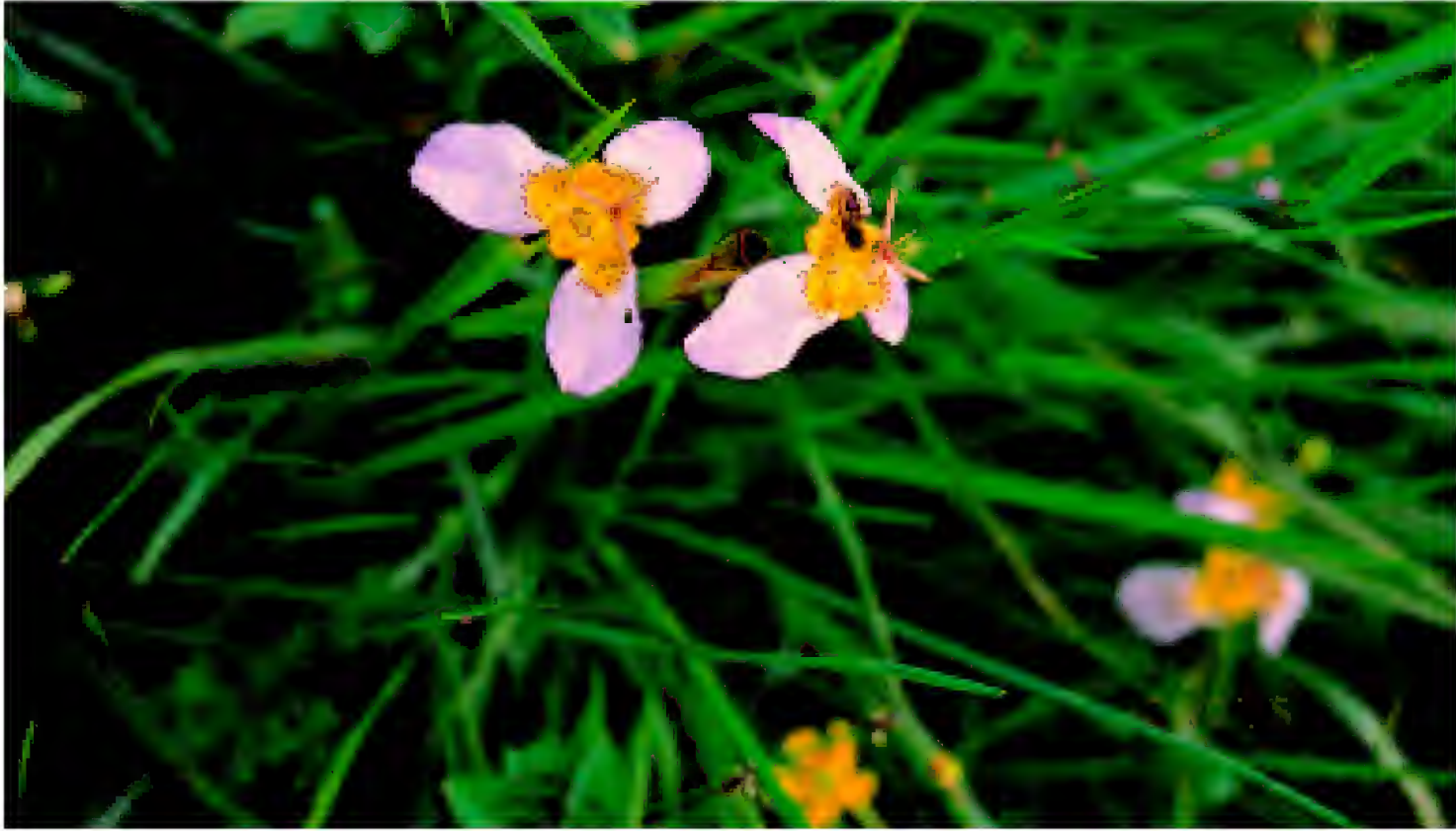
Fig. 4. Tigridia mariaetrinitatis Espejo & López-Ferrari in its natural habitat.