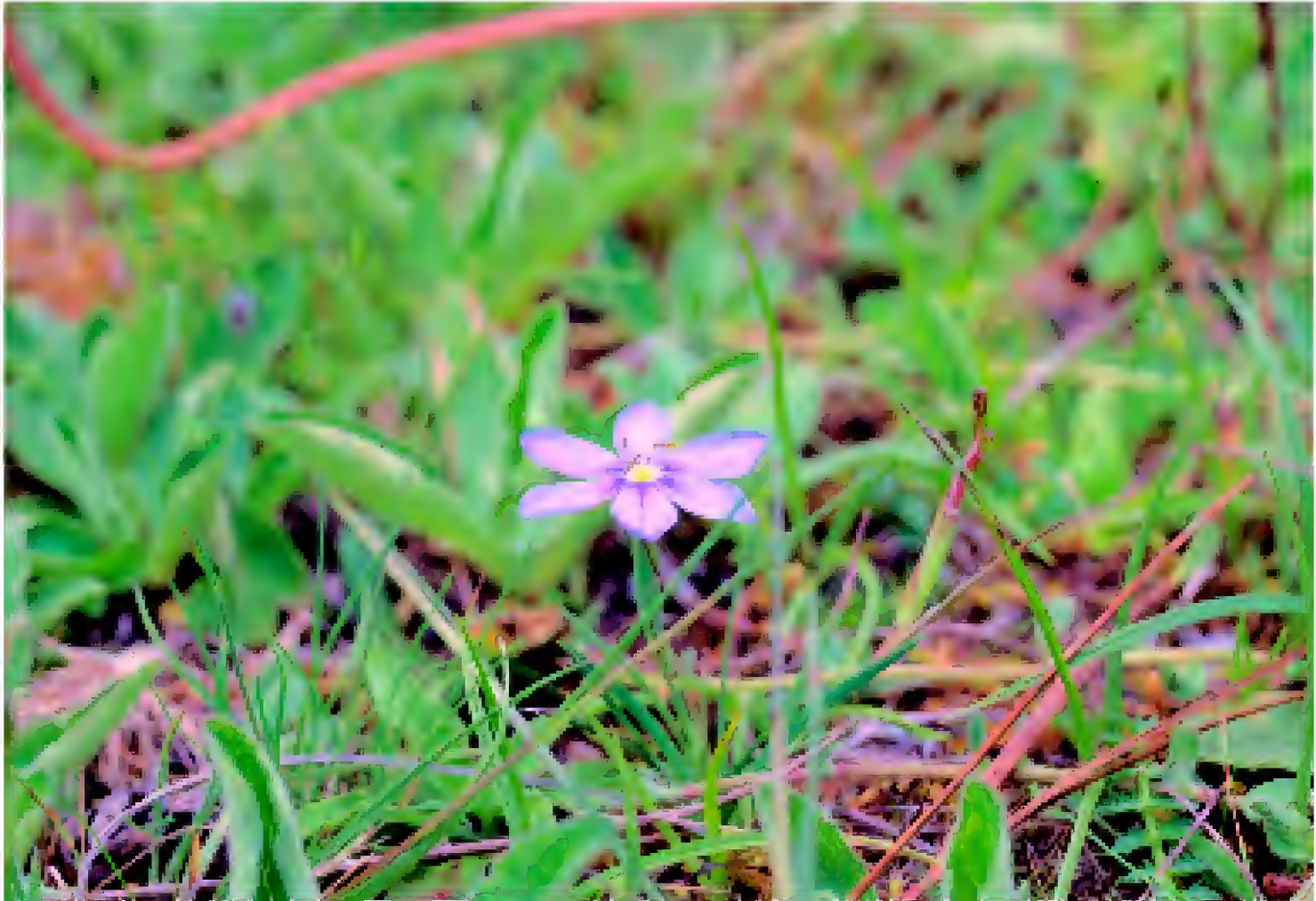
Fig. 2. Sisyrinchium planicola Ceja & Cholewa in its natural habitat.

are also distinctive. S. planicola is similar in vegetative morphology to S. johnstonii Standl. and probably confused with it in herbarium material. However the analysis of the floral structure allows the clear delimitation of both species. In S. planicola the flowers are light blue-purple with the tepals extended and rounded at the apex while S. johnstonii has white to blue campanulate flowers with the tepals apiculate. The name of the species refers to the type locality, the flood plains of Llano de las Flores, Oaxaca.