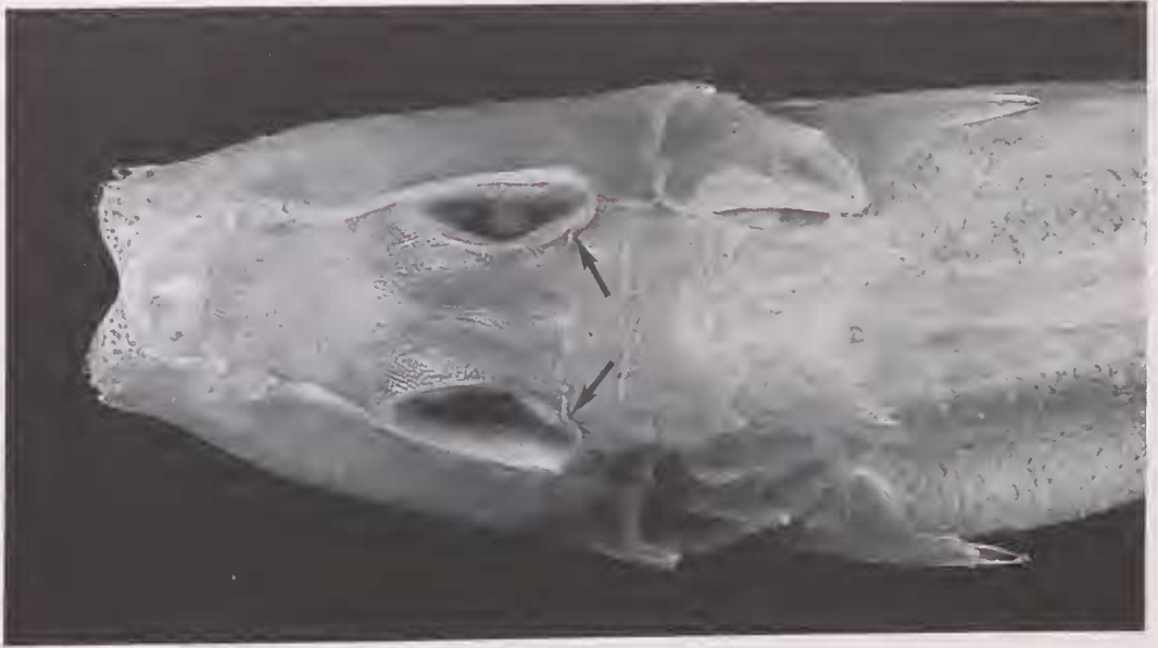
Fig. 3. Dorsal view of the head of the holotype NTM-S-11953-003 of Lepidotrigla russelli sp. nov. Arrow marks the incomplete post-orbital groove.