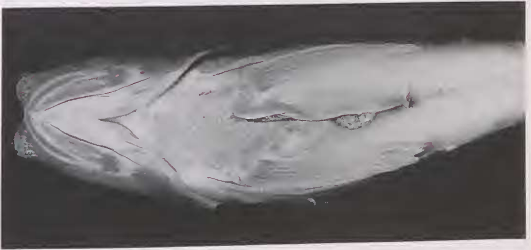
Fig. 4. Ventral view of the holotype NTM-S-11953-003 of Lepidotrigla russelli sp. nov. showing the squamation of the chest, breast and belly. Note the size of the scales.

Coloration in alcohol. Head and body yellowish brown. Body pale yellow in scaled areas, but where the body scales are missing, the color appears pinkish. Ventral region whitish. Pectoral fin black except for the two uppermost rays which are pale, as are the free pectoral rays. In some cases there are traces of scattered dark spots on the spinous dorsal fin, spots which are lacking in the holotype. Other fins pale.