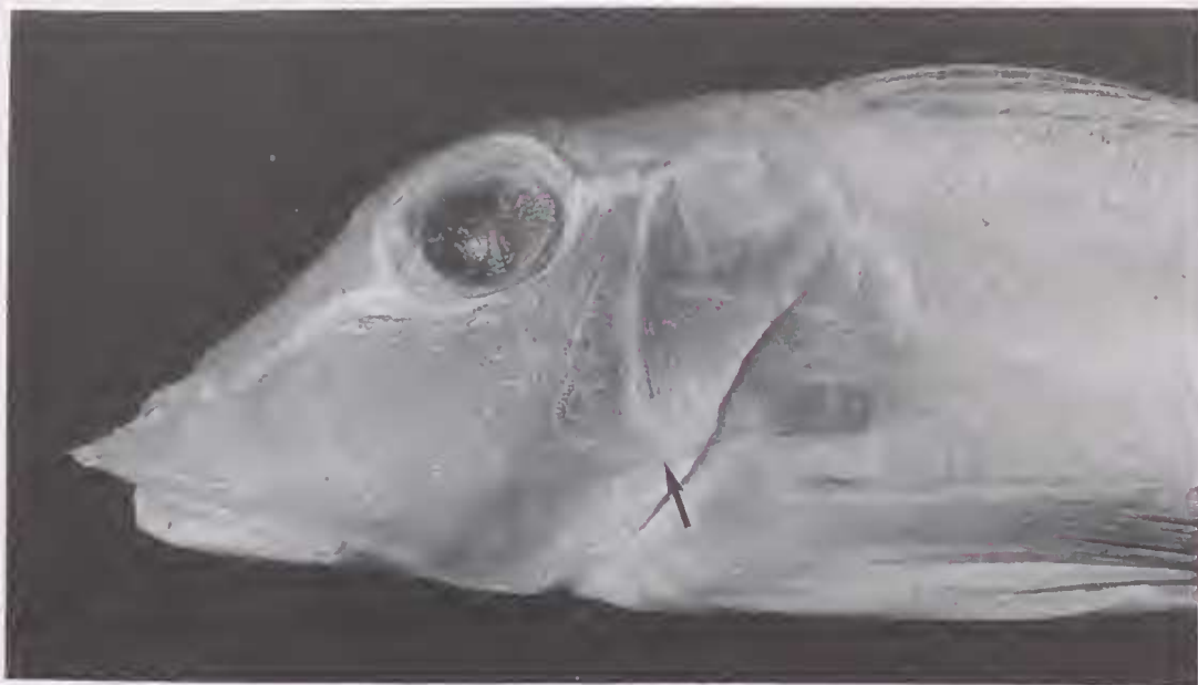
Fig. 2. Lateral view of the head of the holotype NTM-S-11953-003 of Lepidotrigla russelli sp. nov.. Arrow marks the preopercular spine and ridge.

Body robust anteriorly, slender posteriorly and covered with large, firmly attached cycloid scales, smaller on the chest, breast and belly, numbering 12 to 13 between pelvic fin bases. Lateral line scales 58 in holotype (57-63 in paratypes), with their tubes slightly branched (forming three branches); lateral line extending onto the caudal fin forming a bifurcation. Both sides of dorsal fin bases armoured with 22 erect bony crests (22-23 in paratypes), flattened in front and rising backwards, with eight erect bony crests (seven to nine in paratypes, modally eight) at the base of the first dorsal, and 14 at the base of the second dorsal fin; some specimens have one or two interdorsal crests.