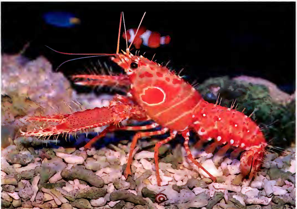
FIG. 1. — Enoplometopus crosnieri n.sp., holotype ovig. ♀, 55.4 mm cl., Keelung, Taiwan (NTOU 1997-1-H).

ventral spines, inner margin serrated, consisting of row of sharp teeth; basis with distoventral spine. First chelipeds exceeding scaphocerite by one half carpus; almost equal in size and shape except for cutting edges of fingers; chelae with fingers slightly longer than palm; fixed finger slightly longer than movable finger, outer and inner margins heavily serrated with large teeth and covered with many long stiff hairs, tips of fingers elongate and curving inwards; dorsal and ventral surfaces of palm densely covered with sharp tubercles except for marginal areas; dorsal hinge of fingers armed with large tooth, ventral hinge bearing large tubercle; fingers distinctly ridged medially and bearing only few sharp tubercles near bases; cutting edges of right fingers distributed with many small crushing teeth as well as a few larger ones on that of movable finger, while that of fixed finger also bearing five large broad teeth; cutting edges of left fingers serrated, with numerous small sharp teeth, that of fixed finger also bearing six large teeth while that