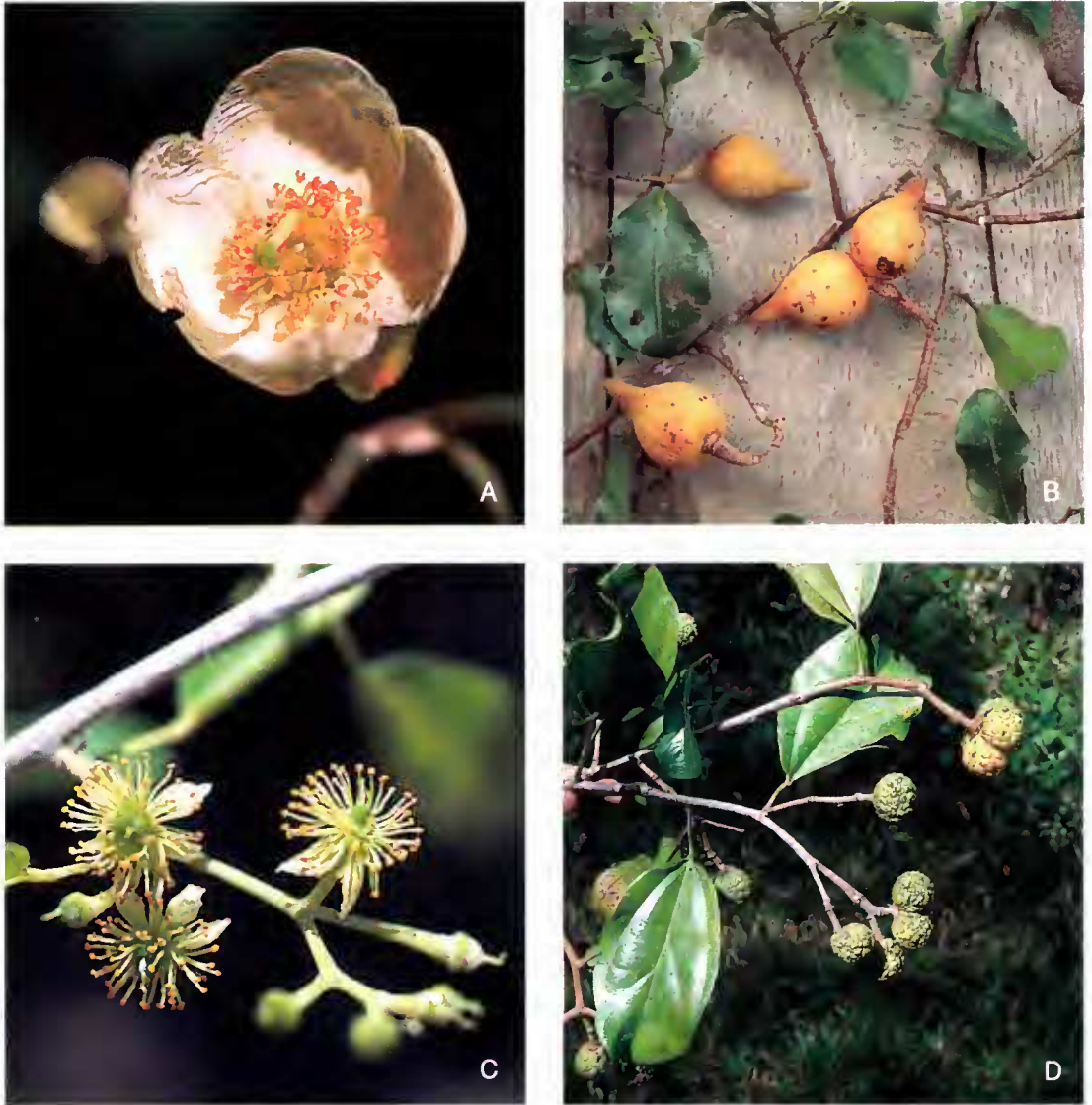
Fig. 3.—Photographs of Sphaerosepalaceae : A, Dialyceras coriaceum (Schatz 3848); B, D. parvifolium (Schatz 3082); C, Rhopalocarpus lucidus (Schatz 2472); D, R. thouarsianus (Schatz 3634).—A, photo P. LOWRY; B-D, photos G. SCHATZ.