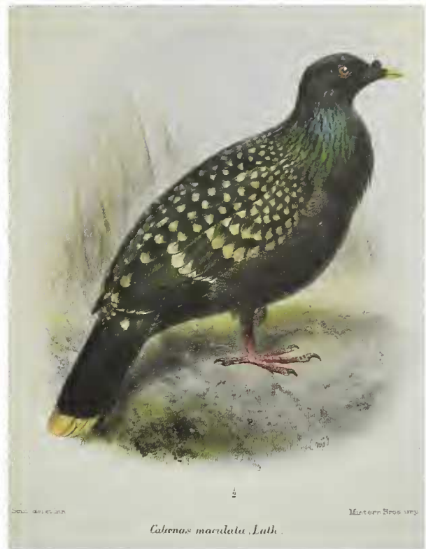
Figure 2. Depiction of Spotted Green Pigeon Caloenas maculata in Forbes (1898), made by Joseph Smit and based on how Forbes assumed the species looked like.