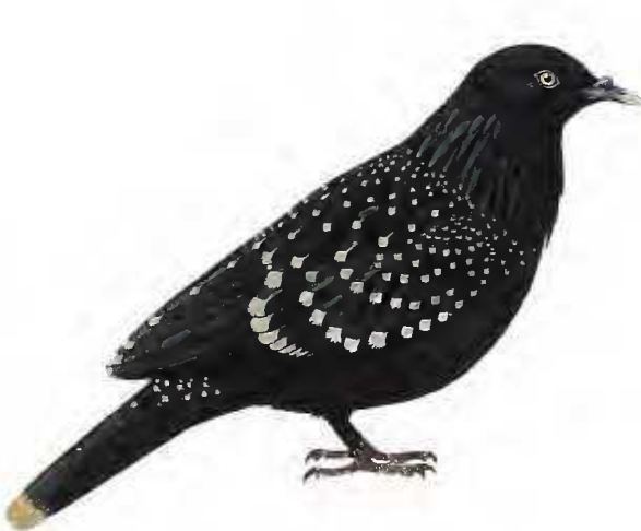
Figure 3. Depiction of Spotted Green Pigeon Caloenas maculata in Fuller (2002) by Brian Small and based on how Fuller assumed the species looked like