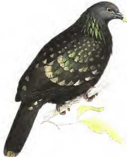
Figure 4. Depiction of Spotted Green Pigeon Caloenas maculata in Gibbs et al. (2001), made by John Cox and based on how Gibbs assumed the species looked like; perching on a branch is probably more accurate than walking on the ground