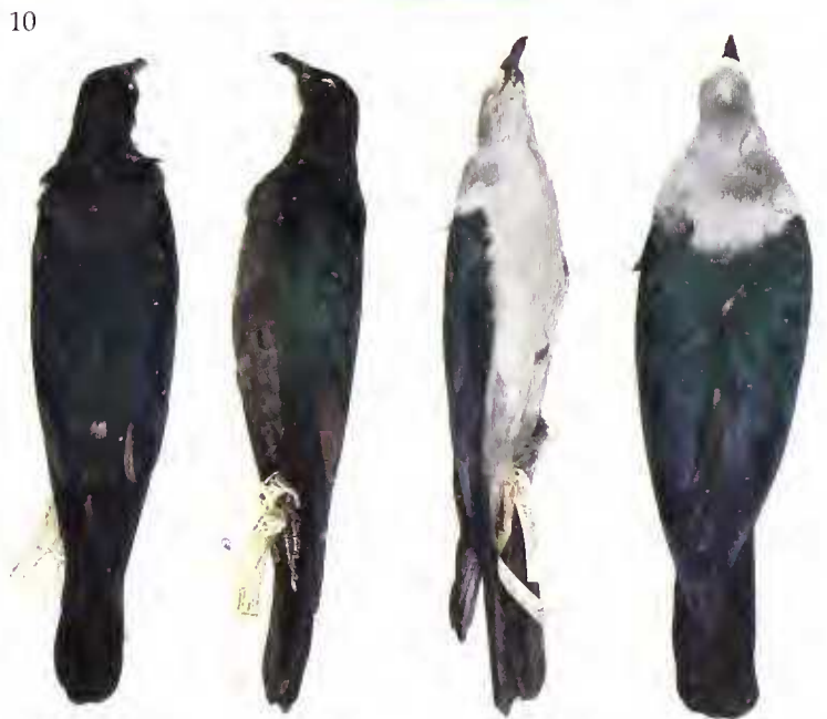
Figure 5. First museum label after the Spotted Green Pigeon Caloenas maculata specimen was re-prepared into a skin (Hein van Grouw)