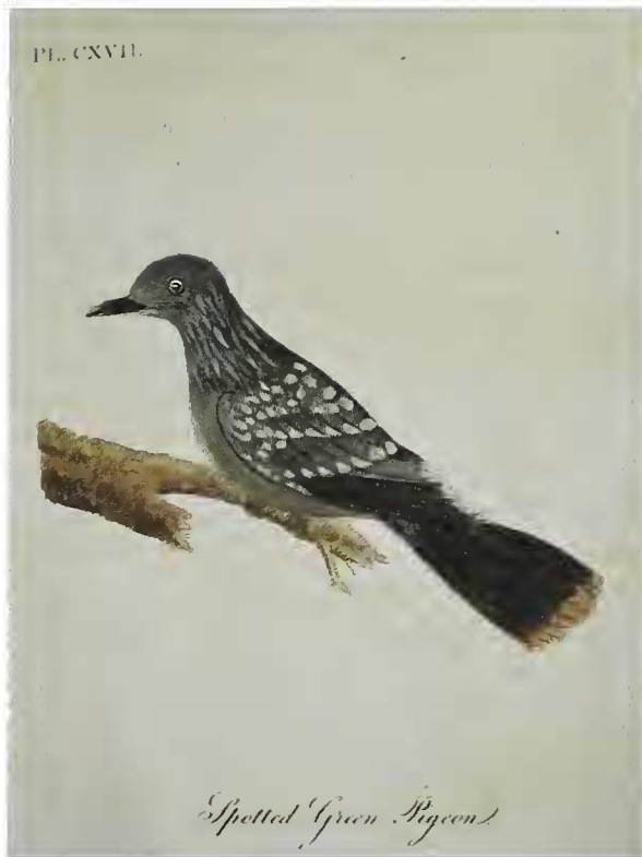
Figure 1. Drawing (engraving) by Latham of Spotted Green Pigeon Caloenas maculata in A general history of birds (1823), presumably based on a picture in Lever's possession; Lever's picture may have been based on a third specimen.