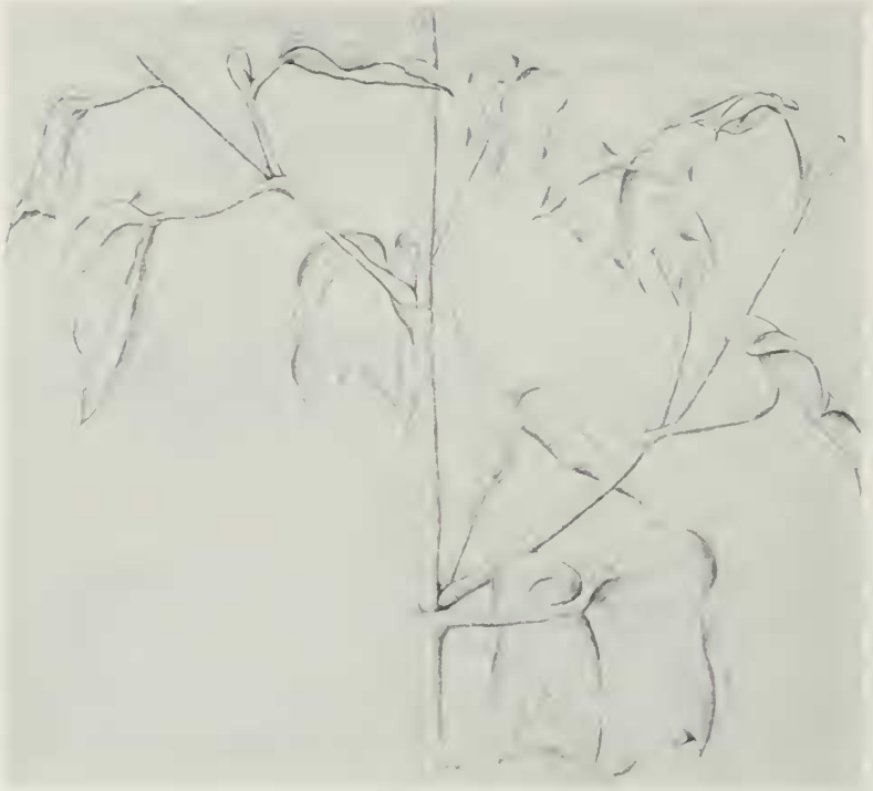
Plate 1. Pencil drawing of a S. populnea shoot showing development of multiple axillary branches along the main axis. (About 1/5 life-size).

problem of branch loss, neither the youngest nodes nor nodes on branches more than 3 cm diameter were included in the census. Branch departure from vertical orientation was used as a measure of vigour; overtopped branches became more horizontal with age.