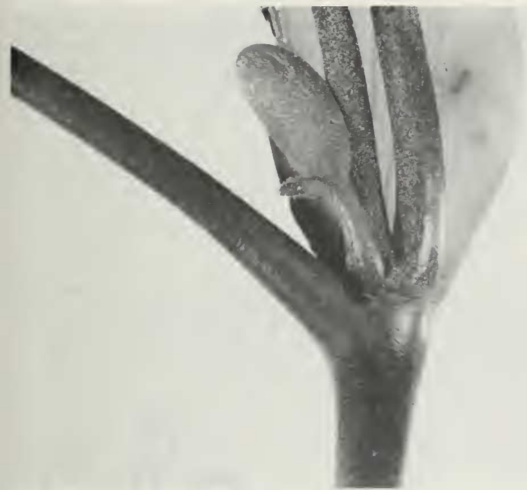
Plate 2. S. populnea shoot apex with one stipule removed. (Approximately life-size).

Developmental studies of S. populnea shoot apices revealed that multiple axillary buds originate as branches of the vascular trace to the primary lateral bud. This branching results in a proliferation of successively higher order axillary lateral meristems (a secondary bud complex; Hallé et al. , 1978) forming what might be called an embryonic short shoot. In S. populnea , each successive axillary branch bud is oriented at approximately 90^\circ to the previous bud, forming a spiral arrangement (fig. 1). Both left-handed and right-handed spirals were observed. Up to four orders of branching were observed within a single apex, and although such "precocious" branching was not limited to apices taken from vertically oriented shoots, it was more vigorously expressed there. Prophyllary buds are known to occur in a variety of species, for example, in many bamboos (McClure, 1976), Leptocarpus simplex (Tomlinson, 1973), Liquidambar styraciflua (Kormanik and Brown, 1967), and Gossypium spp. (Mauney and Ball, 1959; Cook, 1911). S. populnea shoot apices failed to reveal any prophylls, stipules, or other organs subtending the higher order branch buds. Vascular connections, however, show that each successive branch bud (both in terms of initiation and maturation) is an offshoot of the preceding bud (fig. 2).