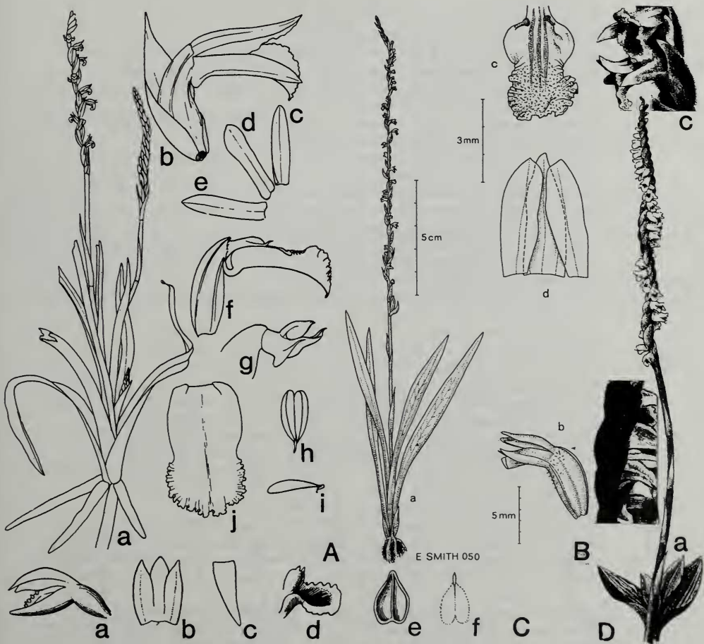
Fig. 3. Spiranthes sinensis . A. Specimen from Taiwan; a, whole plant with two inflorescences; b, flower with bract; c, lateral petal; d, dorsal sepal, e, lateral sepal; f, labellum and gynostemium; g, gynostemium; h, pollinia; i, pollinium; j, labellum. B. Example from Taiwan; a, whole plant; b, flower, \times 4 ; hood formed by two lateral petals and the dorsal sepal, \times 6 ; c, lateral sepal \times 6 ; d, labellum and gynostemium \times 6 ; e, anther \times 10 ; f, pollinia \times 10 . C. Plant from Indochina; a, side view of inflorescence; b, the spiral on the stem of the inflorescence; c, flowers on side (bottom) and 45^\circ (top) view, (sources: A. Lin 1976; B. Seidenfaden 1978; C. Gagnepain and Guillaumin 1933; D. Alessandrini 1985).

Koriba referred to Spiranthes sinensis (Fig. 3; Table 1), the subject of his doctoral dissertation (Koriba 1914), as Spiranthes australis . This is not surprising at all since this species has many synonyms perhaps due to its very wide distribution which includes Japan, Taiwan, Philippines, Indo-Malaya (Pakistan, Himalayas, etc), Afghanistan, Thailand, Indochina, China, Korea, Malaysia, Australasia (New Guinea, Australia, New Zealand, Tasmania, etc) and parts of the Middle East (Gagnepain and Guillaumin 1933; Holttum 1964; Garay and Sweet 1974; Lin 1976; Rechinger 1978; Seidenfaden 1978). The plants are terrestrial and very variable in form and size.