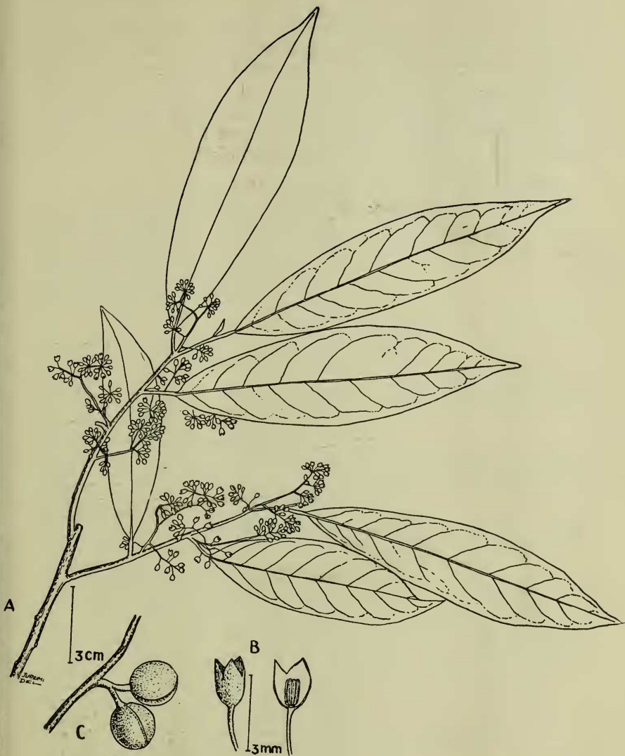
Fig. 2. Gymnacranthera paniculata (A. DC.) Warb. var. paniculata .

A, Leafy twig with male flowers. B, male flowers enlarged. C, fruit. A-B, from Cuming 901. C, from Borden 669.