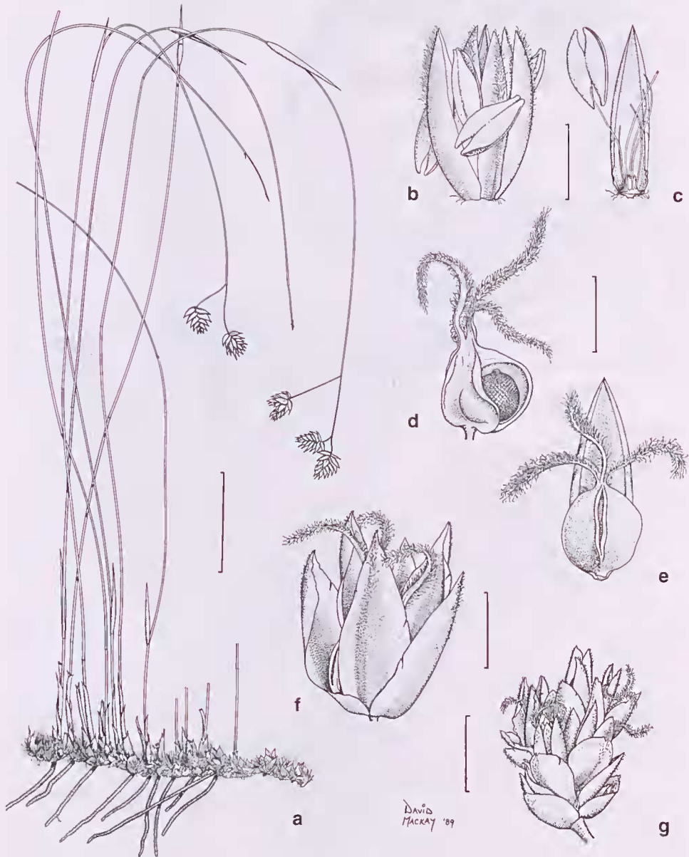
Fig. 2. Georgantha hexandra . a, habit. b, male flower. c, dissected male flower. d, fruit with seed. e, f, female flower. g, spikelet. a-c, from Briggs 7461; d, Briggs 6395; e, Gittins 17 106; f, Haegi 1911. Scale bars: a = 5 cm, b-f = 3mm, g = 6 mm.