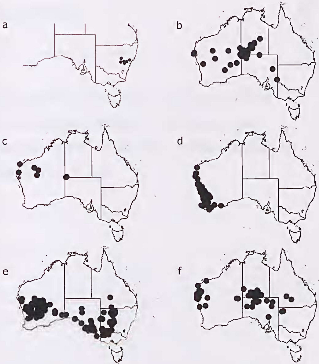
Figure 17. Distribution of a. Podolepis canescens ; b. P. eremaea ; c. P. remota ; d. P. aristata subsp. aristata ; e. P. aristata subsp. affinis ; f. P. aristata subsp. auriculata