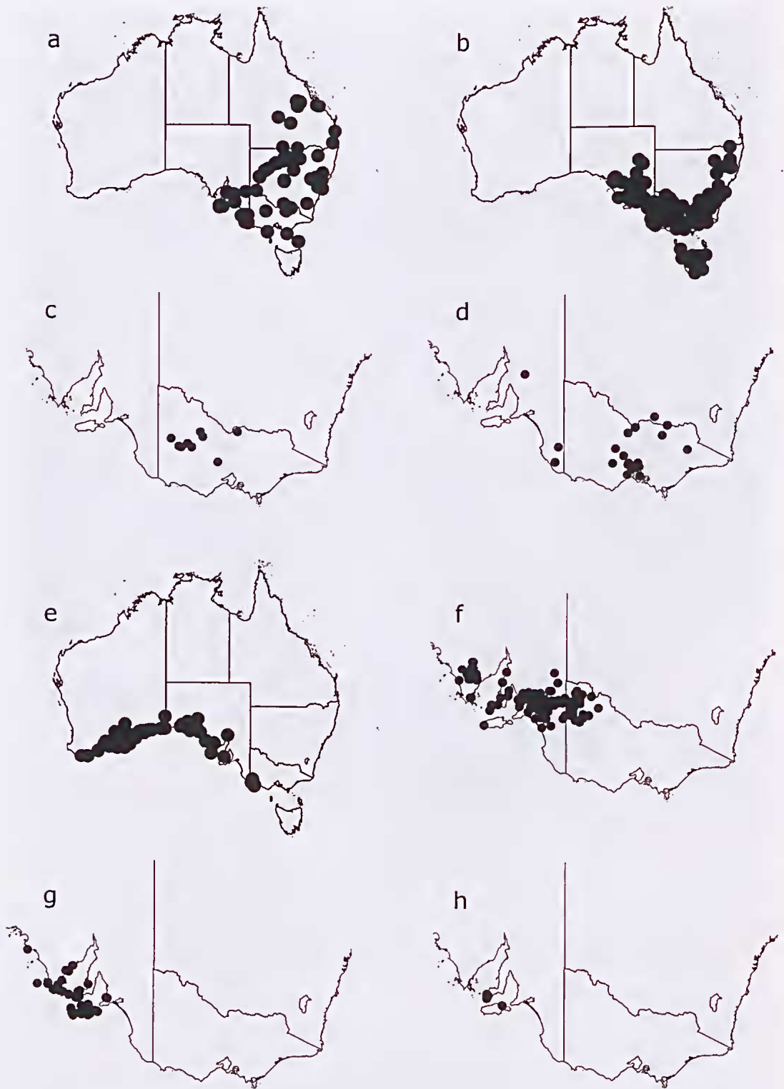
Figure 16. Distribution of a. Padolepis jaceoides ; b. P. decipiens ; c. P. laevigata ; d. P. linearifolia ; e. P. rugata subsp. rugata ; f. P. rugata subsp. glabrata ; g. P. rugata subsp. littoralis ; h. P. rugata subsp. trullata