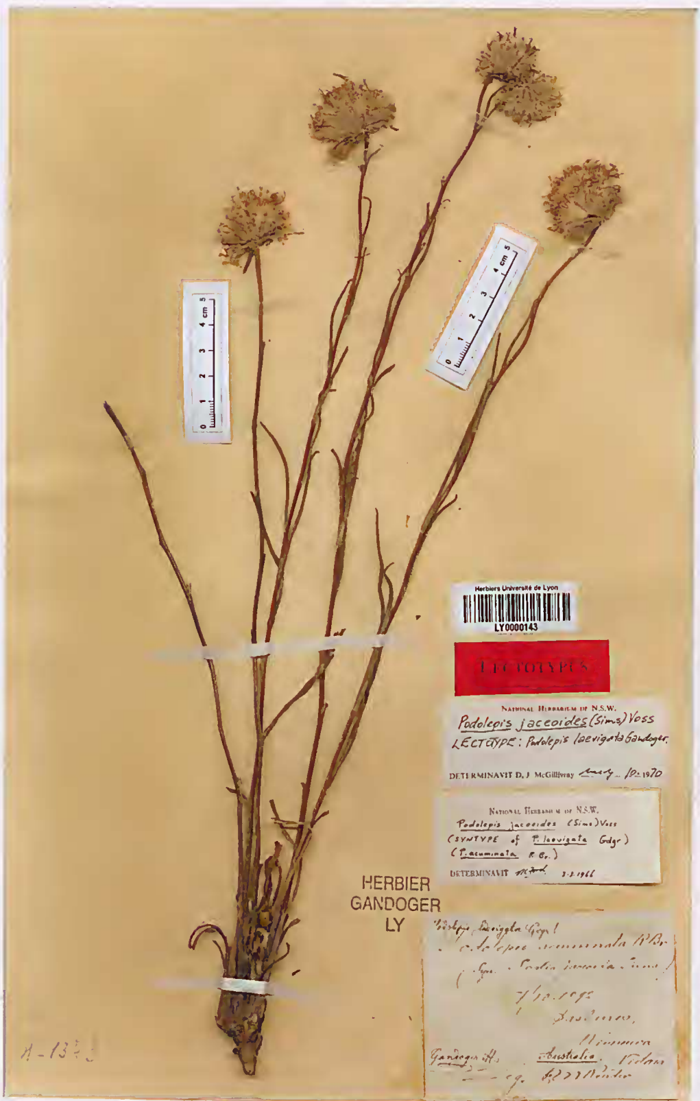
Figure 4. Lectotype of Podolepis laevigata (F.M.Reader s.n. LY 0000143).