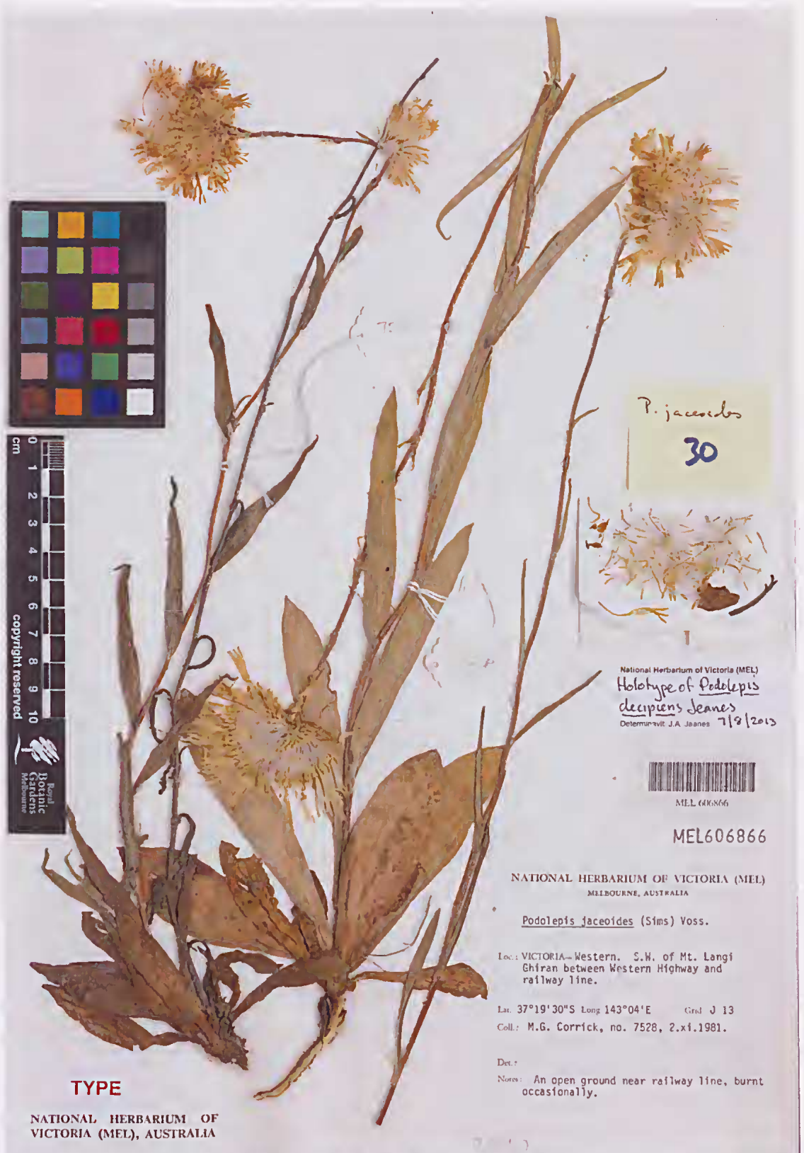
Figure 3. Holotype of Podolepis decipiens (MEL 606866)