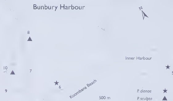
Figure 2. Distribution of sphaeromatid isopods in Bunbury Harbour.

Edwards 1840), Syncassidina aestuaria Baker, 1928, Paracerceis sculpta (Holmes 1904) and Paradella diana (Menzies 1962). Sphaeroma quoyanum , S. aestuaria and C. gambosa define an estuarine environment. We found their occurrence restricted to the Leschenault Estuary and the Collie River, with C. gambosa occurring exclusively in the Collie River (Fig 1). Collecting in the estuary yielded only a few specimens while particularly S. quoyanum was found in great abundance on bridge piles in the Collie river. Overall, the species diversity and the availability of hard substrates as habitat is higher in the Collie River than the estuary. Bunbury Harbour, on the other hand, offers a great number of colonizable hard substrates mainly in the form of man-made constructions such as jetties and groynes. Two species, P. diana and P. sculpta , were collected from these habitats (Fig 2). P. sculpta usually resides among algae, barnacles, ascidians and fanworms while P. diana also colonizes the underside of rocks. Both species are known to be introduced to harbours around the world, but P. sculpta has not been reported before from Western Australia. The occurrence of I. excavatus , Exosphaeroma sp and C. trilobita in 1995 could not be confirmed in 1997 (Table 1).