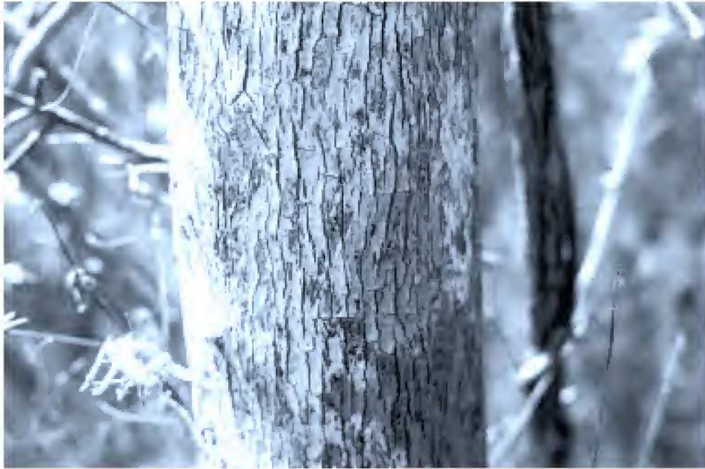
Fig. 2. Main trunk of Rhodamnia angustifolia at breast height ( Halford & Snow Q3456) showing smooth, slightly fissured, grey bark.