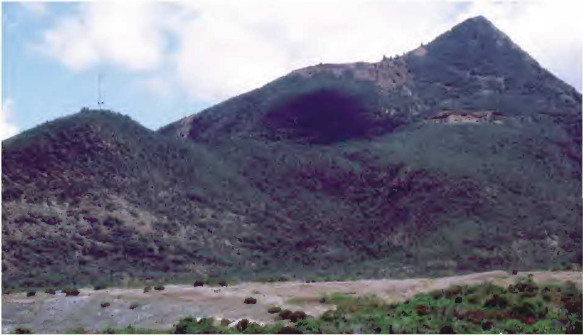
Fig. 5. Tsiba near Ouaco, the small population of Celatiscincus similis n.sp. at this site was located in low closed vegetation in the centre of the photo.