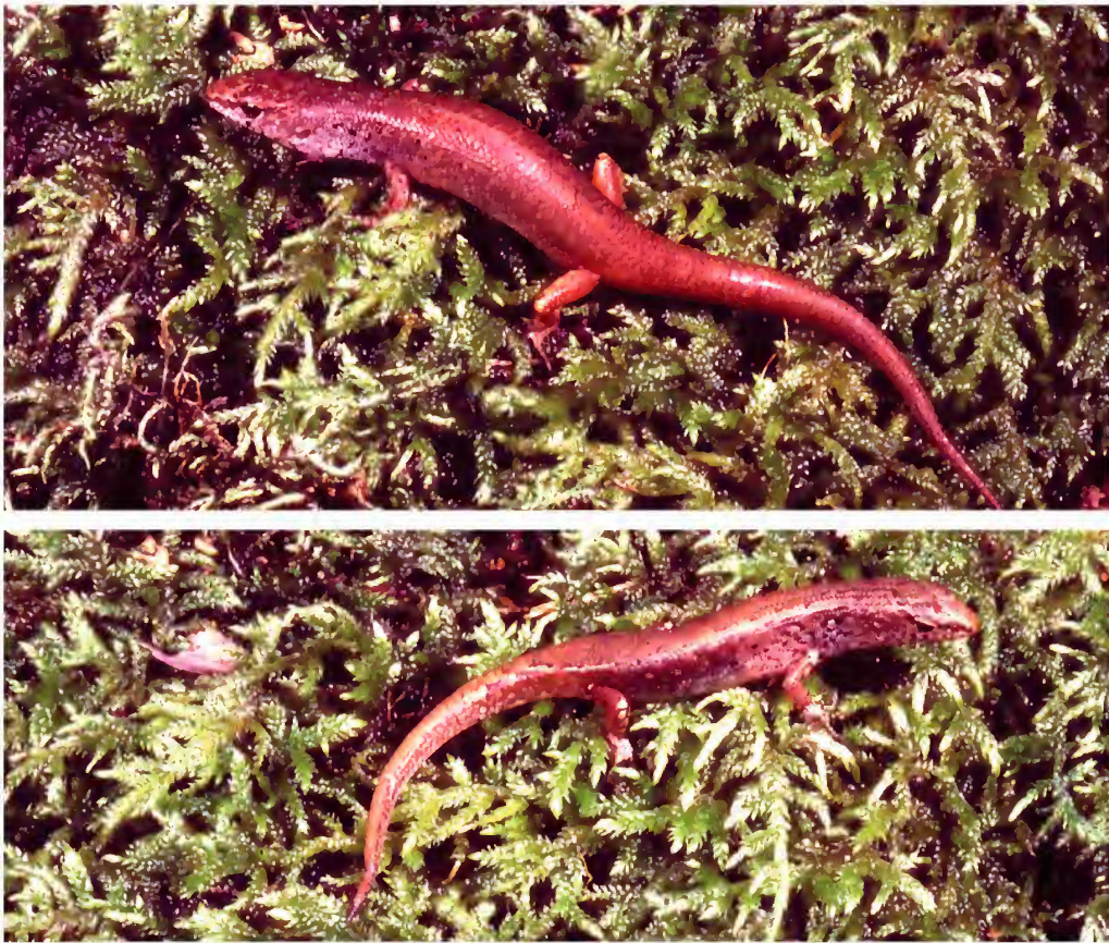
Fig. 1. Celatiscincus euryotis , an adult male (above) and adult female (below) from Waa Mé Bay, Isle of Pines, New Caledonia.

narrow, white hip stripe (dark-edged above) that extends over the hindlimbs and along basal portion of tail that is not present in adult males.