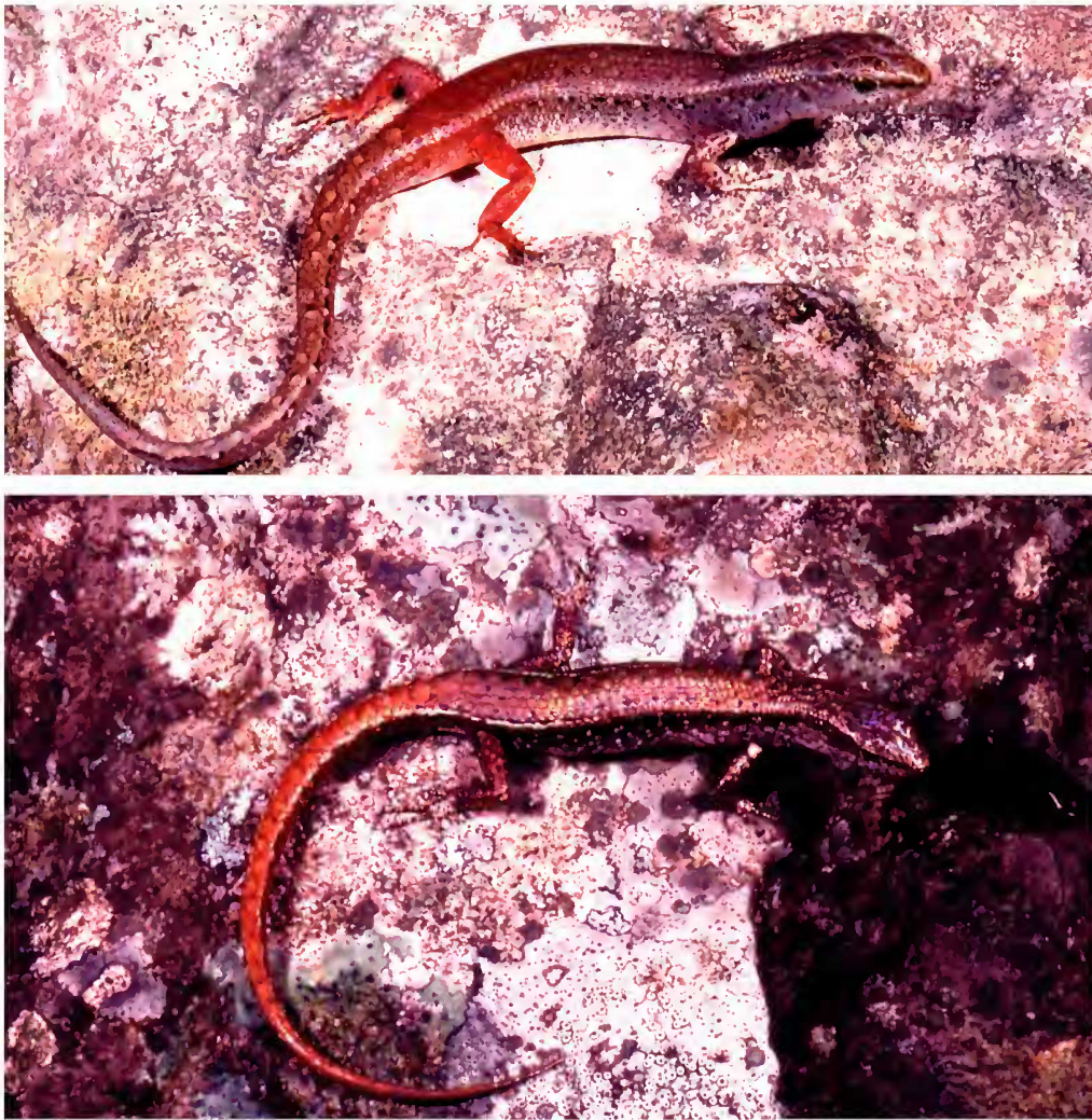
Fig. 4. Celatiscincus similis n.sp., an adult male (upper—AMS R153524) and adult female (lower—AMS R153525) from Tsiba, northwest New Caledonia.

more lamellae beneath fourth toe ( \bar{x} 35.4 vs 32.2, t_{58} = -7.10 , P < 0.01 )—see Table 1. Further, there were significant differences in the modal number of presacral vertebrae between the two species, but again these were not unequivocal.