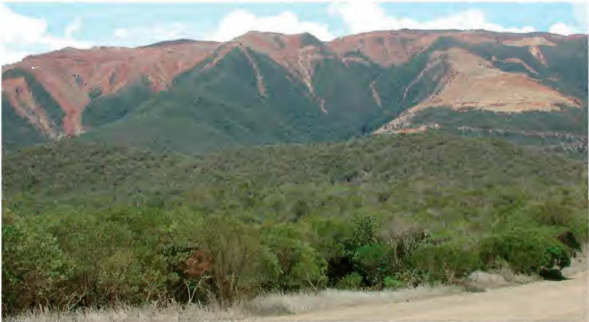
Fig. 6. Ultramafic ranges south of Pouembout in northwestern New Caledonia, showing impact of strip mining on the environment.

independent histories that form a basal polytomy within Australo-Pacific Eugongylus group skinks. There is no evidence to suggest that Celatiscincus is more closely related to Marmorosphax or Sigaloseps than to other New Caledonian skink genera. As such, we regard the genetic data as supporting our morphological interpretation of the distinctiveness of Celatiscincus . Although we remain ignorant of the position of Celatiscincus within the New Caledonian Eugongylus group, we believe that the erection of a new genus serves an important purpose: to highlight Celatiscincus as a distinctive, monophyletic lineage that must be considered separately from all others in future phylogenetic analyses.