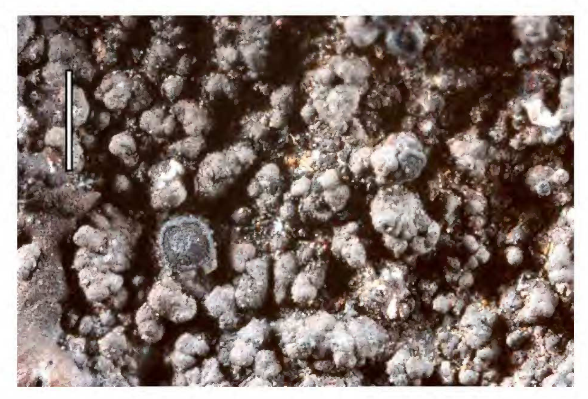
Fig. 2. Monerolechia glomerulans (Elix 41083in CANB). Scale: = 1 mm

Like other species of Monerolechia , M. glomerulans is closely associated with or initially parasitic on various Xanthoparmelia species. It is characterized by the olive-brown to olive-black, bullate to squamulose thalli, black lecideine apothecia, small, Buellia -type ascospores, 10-15 \mu m \log , 5-8 \mu m wide, and bacilliform conidia, 4-6 \mu m \log , 1-1.5 \mu m wide. However, the most characteristic feature of this species is the morphology of the thallus where the bullate areoles or convex squamules become clustered closely together and agglomerated to form weakly elevated, broccoli-like heads (or glomerules). With age these glomerules may become markedly elevated or stalked (to 3 mm high) and isidia-like. Since more specimens of this rare species are now available an amended description follows.