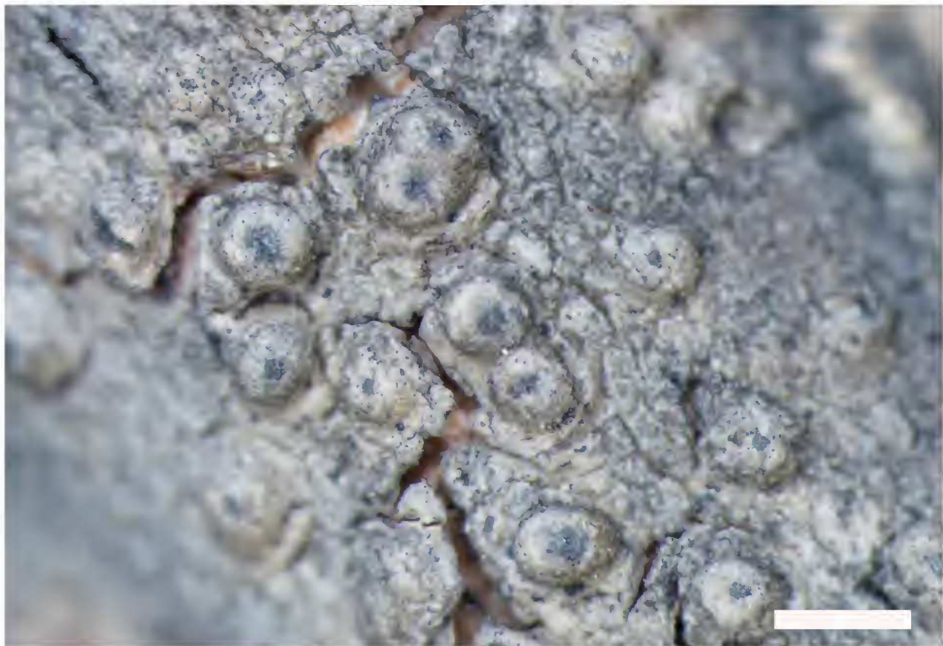
Fig. 3. Pertusaria yulongensis (holotype). Image showing verruciform apothecia with concave, black apices. Scale bar = 1 mm.

Additional specimen examined: CHINA: YUNNAN: Yulong County, Lidiping, alt. 3250 m, on branch, J. X. Xi 0159(h), 16 Jun 1984 (KUN 11537).