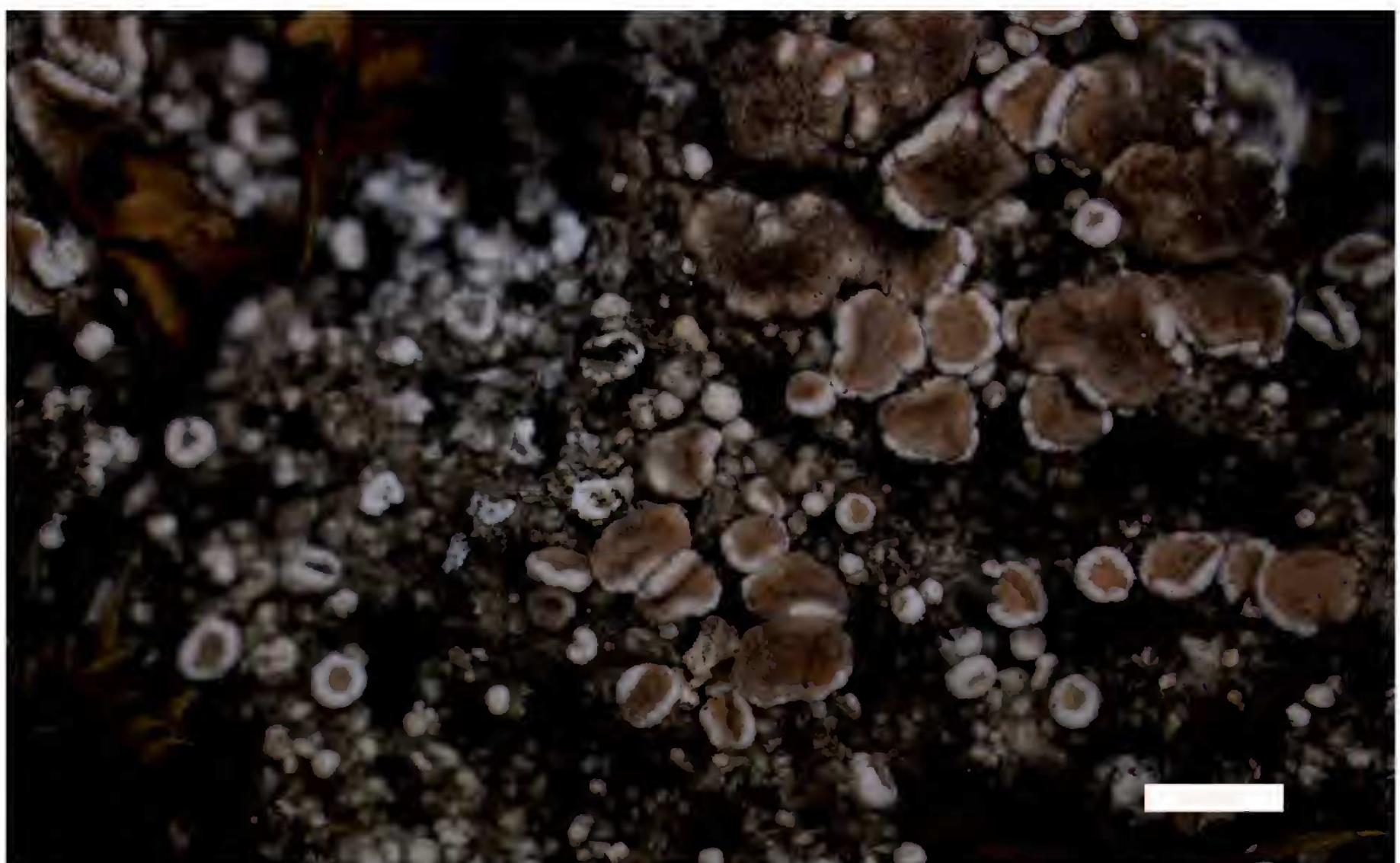
Fig. 2. Pertusaria montana (holotype). Image showing a muscicolous thallus and disciform apothecia with epruinose or slightly pruinose, pink disc. Scale bar = 2 mm.

Comments: Pertusaria montana resembles P. bryontha both in general appearance and habitat. Both are arctic-alpine species growing on mosses and plant debris and contain one ascospore per ascus. Pertusaria bryontha has a dark brown disc, contains stictic acid and its epihymenium is K+ purple (Chambers et al. 2009) whereas the new species has a pink disc, lacks stictic acid and has a K– epihymenium.