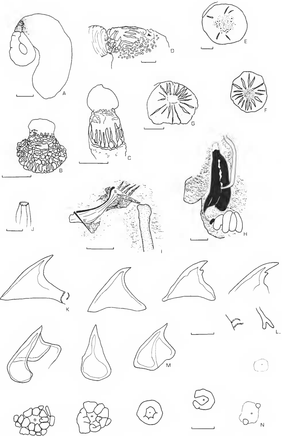
FIG. 1. — Aspidosiphon heteropsammiarum (Deshayes, 1863) : A, entire specimen showing the anal shield (scale bar : 1,5 mm) ; B & C, anal shields from two different specimens (scale bar : 1 mm) ; D, side view of the anal shield represented in C (scale bar : 0,5 mm) ; E, F & G, caudal shields from three specimens (scale bar : 1 mm) ; H, posterior region dissected, showing the attachment of the spindle muscle (scale bar : 1 mm) ; I, anterior region dissected showing the split of the spindle muscle in two fine strands, s : dorsal to rectum and s' : with the extension of rectum to body wall (scale bar : 1 mm) ; J, tubular papilla from introvert (scale bar : 0,05 mm) ; K, single-pointed and double-pointed hooks from introvert ; L, accessory spinelets (left) and a split (right) at anterior bases of some hooks ; M, spines from posterior region of the introvert (K, L & M to same scale : 0,01 mm) ; N, different views of papillae of the trunk, showing both coalescence of platelets and absence of them (scale bar : 0,05 mm).