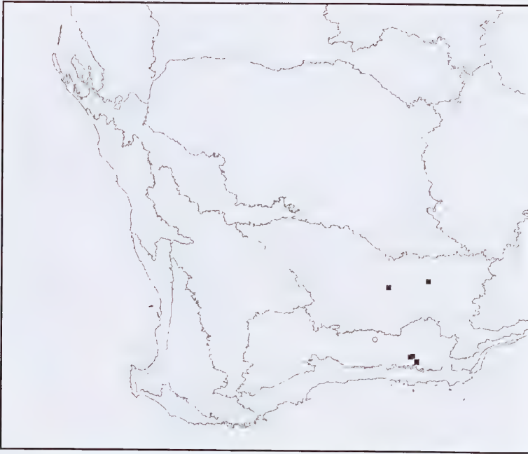
Figure 3. Distribution of Olearia newbeyi (o) and O. trifurcata (■).