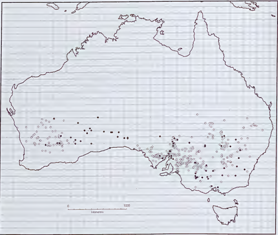
Figure 1. Distribution of Olearia incana (●) and O. pimeleoides (○).