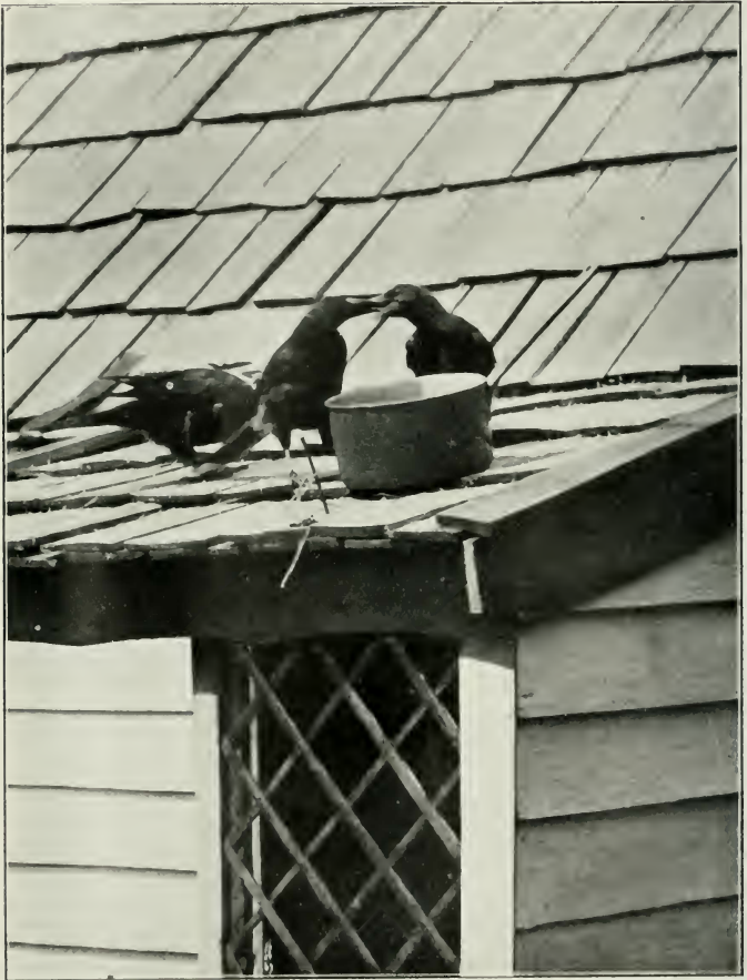
Young being fed by a Black Mag.—the Black Bell-Magpie ( Strepera fuliginosa ).