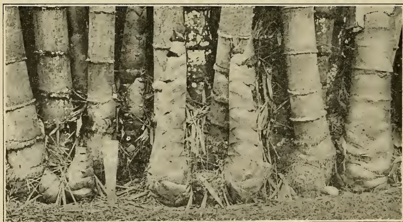
FIG. 21. Old and young stems of Dendrocalamus giganteus .

feet tall, with flower clusters six inches across, while the colors are orange, or scarlet, or deep crimson. In every case the flower cluster is a dense head, in which the chief color comes from the conspicuous bracts, while the individual flowers are small and by no means showy. The outer bracts are usually somewhat larger, and spread horizontally, thus simulating the rays of a composite. Within these the flat cluster of flowers blooms centripetally, so that the resemblance to a composite head is quite noticeable. After blooming the bracts wither, and the heads of subspherical fruits become ovoid. Few tropical plants are so conspicuous when in bloom as these gingers, with their