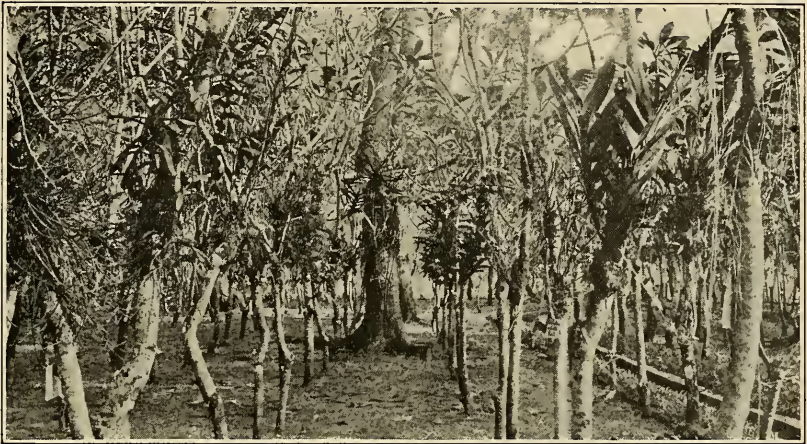
Fig. 20. Portion of the orchid collection, Buitenzorg, Java.

Among the great multitude of species, two seem to be of special interest. One of these is the giant orchid Grammatophyllum speciosum , probably the largest known species of orchid, of which the largest known individual is one of the several planted in the Buitenzorg garden. Like most of the others, it is epiphytic. It grows completely around the trunk of a canary tree, about sixteen inches in diameter, at a height of about