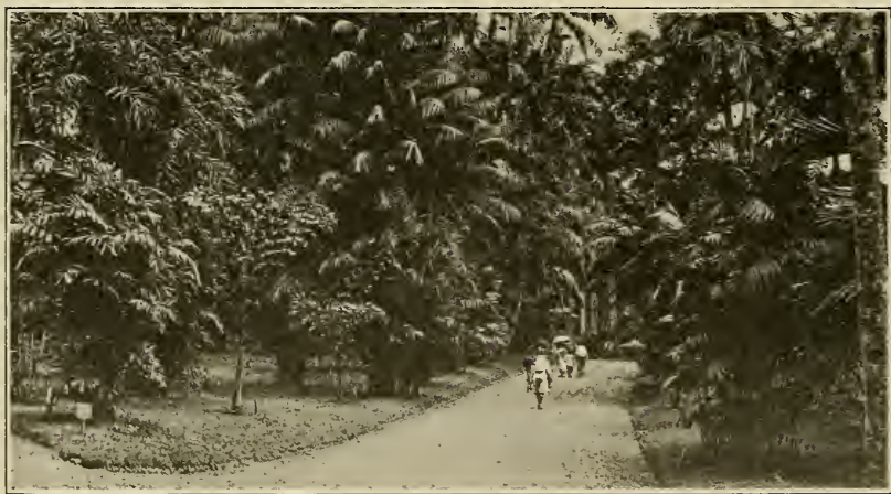
FIG. 18. One of the main avenues through the botanical garden at Buitenzorg.

feet. The second main branch goes nearly horizontally into a Pterocarpus tree forty feet away, rests in a crotch there at a height of fifty feet, and then loops down and across some eighty feet to another tree, in which loops may be traced for at least eighty feet more. This branch is therefore approximately 260 feet long. Growing thus in the open, where its branches and swinging loops may be easily traced, this climber gives one a vivid impression of the huge dimensions reached by tropical lianas. There is a still larger specimen of the same species growing in the Economic Garden at Buitenzorg, which will be described in that connection.