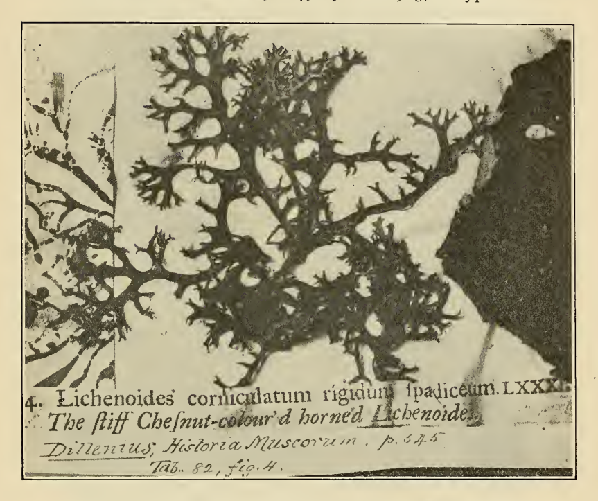
FIG. 7. The Dillenian type of Cetraria Richardsonii preserved at Oxford, England. An alga is mounted to the right on the same sheet.

ORIGINAL DESCRIPTION: "foliaceus, erectus, laciniatus albus, scutellis poticis, cucullatis, fuscis." l. c. Smith in epist. FIGURE: Smith, Act. Soc. Linn. 5: Pl. 4. f. 7. 1791. Howe, Bot. Gazette 56: 498. f. 1. 1913, of type.