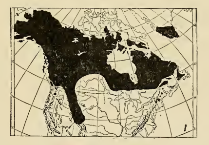
FIG. 1. Range of Cetraria islandica (L.) Ach.

(b) Laciniae slender above (C. islandica var. gracilis see Cummings, Lich. Alaska 144. 1900).