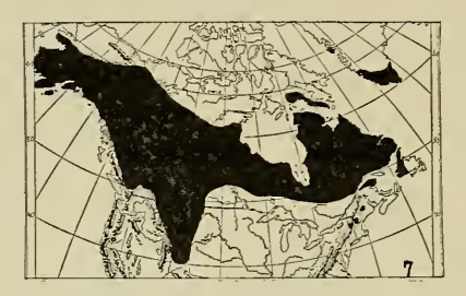
FIG. 10. Range of Cetraria nivalis (L.) Ach.

cm.), margins lacerate, rarely subspiculose at the apices (spicules often black tipped). Apothecia rare, adnate, subterminal, ample (max, diam. 8 mm.), convex, margins crenulate, disk pale chestnut. Spores 7-8 \times 3-4 \mu .