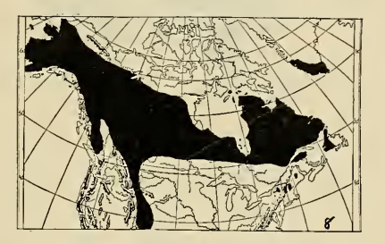
FIG. 9. Range of Cetraria cucullata (Bell.) Ach.