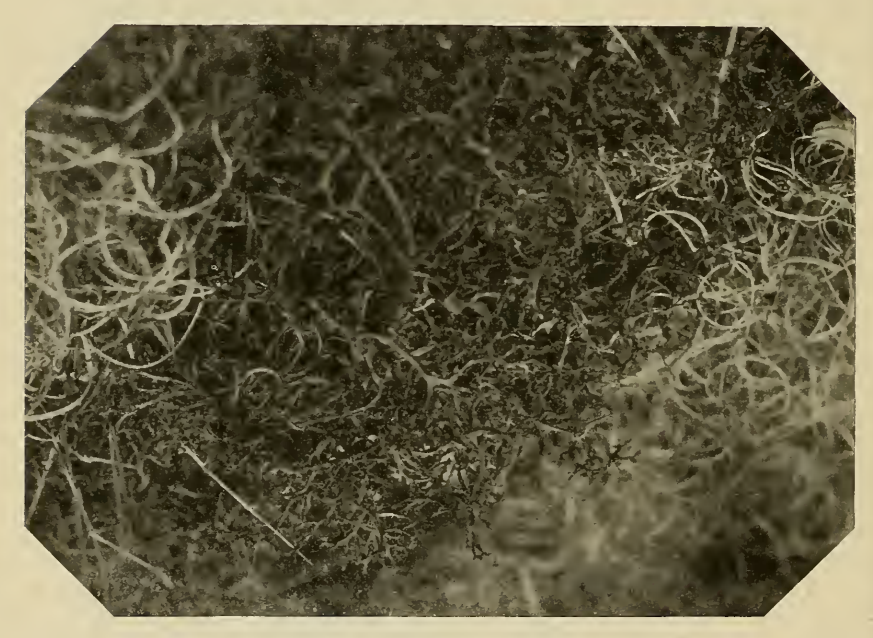
FIG. 3. Cetraria tenuifolia growing at Norwood, Mass.

"Est in Phytophylacio Sherardino ejus exemplar, dictae figurae respondens, foliis vel caulicaulis angusti-