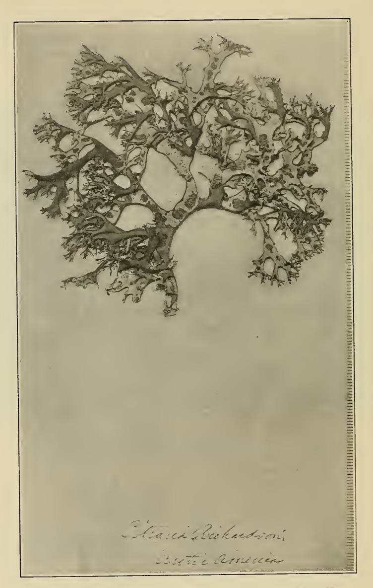
FIG. 8. The Hooker type of Cetraria Richardsonii preserved at Kew.