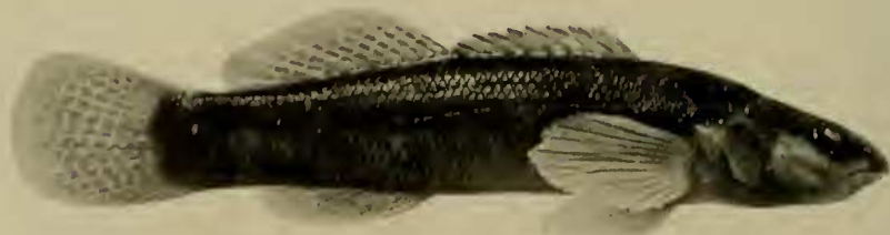
FIG. 1.— Etheostoma olivaceum holotype (INHS 75734), male, 50.5 mm SL, Rock Springs Branch, Putnam Co., Tennessee, 14 June 1975.

Holotype. —Illinois Natural History Survey 75734, an adult male 50.5 mm SL (Fig. 1), collected in Rock Springs Branch at Rock Springs Church, 2 km N Buffalo Valley (36° 10' N, 85° 47' W), Putnam County, Tennessee, on 14 June 1975 by B. M. Burr and L. M. Page.