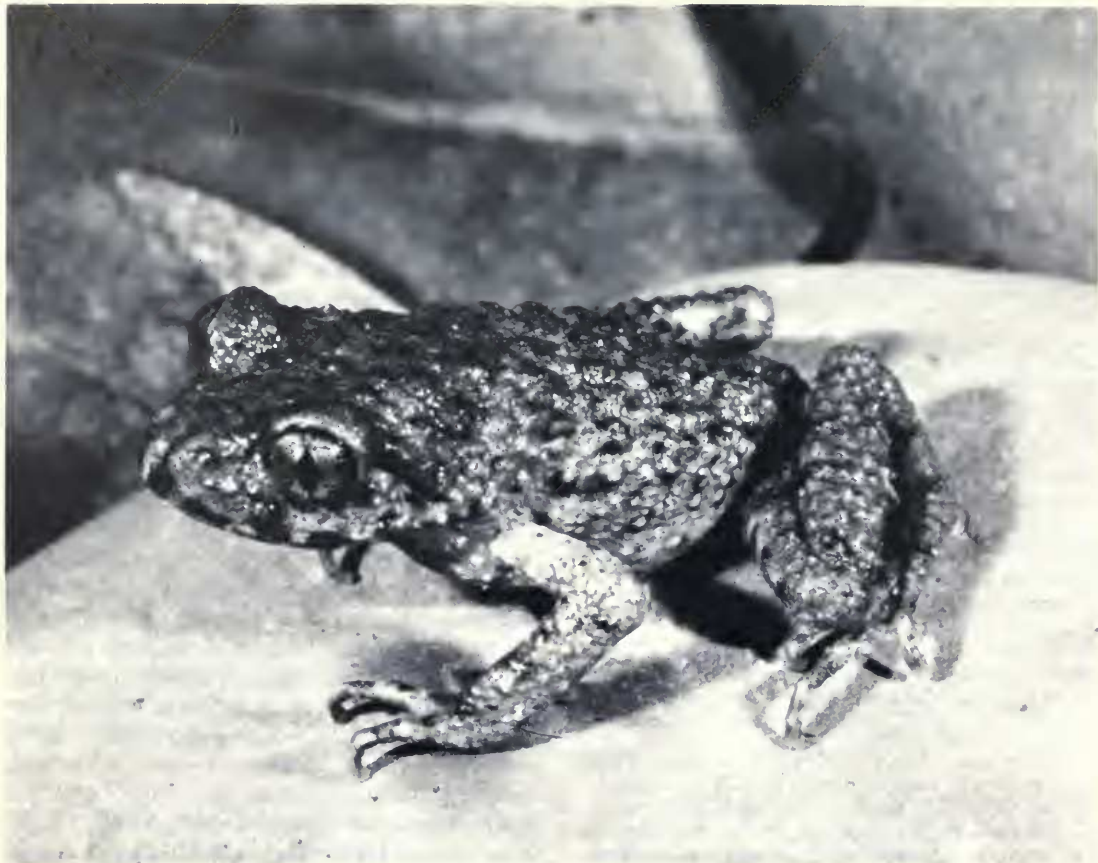
FIG. 4. Oreolalax rugosus (Liu); snout-vent length 47 mm.

Three males, SVL 44–47 mm (mean 46.3); weight 7 g (N = 3). One female, SVL 54 mm; weight 11 g. All were collected on top of Wa Shan at 2520 m in conifer-rhododendron forest. They were in or on the banks of a small (2 m) stream. The three out of water were under a root mat, under a large rock, and in grass.