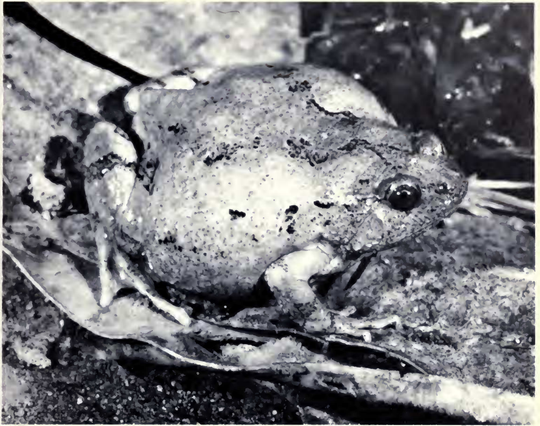
FIG. 5. Calluella yunnanensis Boulenger; snout-vent length 33 mm.

and southeastern Hunan. In all those places the frogs have the typical adenopleura call. In the only area where egg masses were seen, Hunan, they were laid directly in ponds.