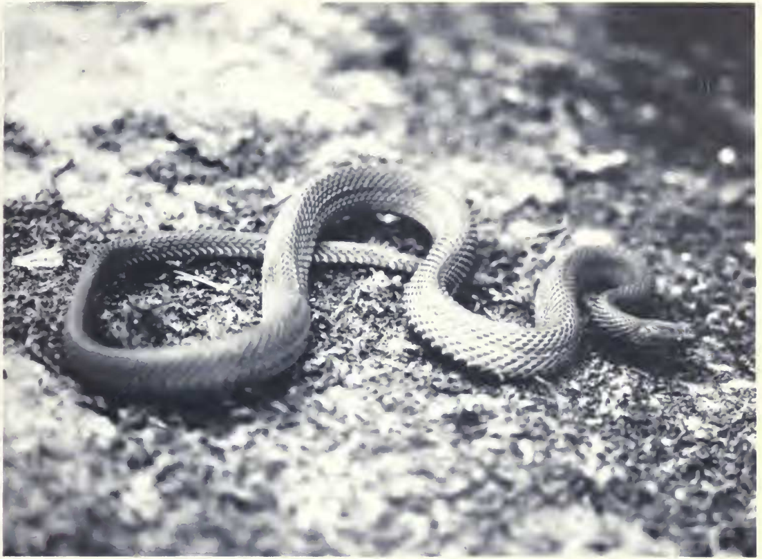
FIG. 9. Achalinus meiguensis Hu and Zhao; snout-vent length 362 mm.

scale rows between lateral stripes 1/2 + 6 + 1/2 . Six from Qing Cheng Shan, 12 from Wa Shan.