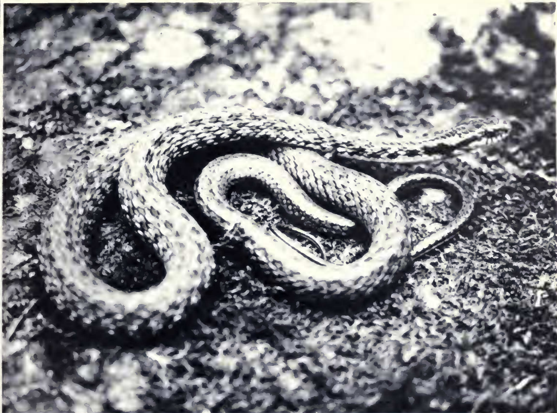
FIG. 10. Amphiesma metusia sp. nov.; snout-vent length 530 mm.

behind mental; first 5 in contact with anterior chin shields. Mental triangular. Chin shields in two pairs, the posterior pair a little longer than the anterior; posterior pair separated only at rear by three small shields arranged in a triangle.