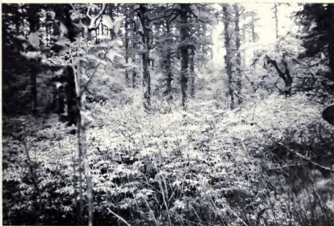
FIG. 2. Vegetation at Wa Shan, Sichuan. Above , broad-leaved evergreen forest at about 1400 m; below , pine, rhododendron, axalea forest at 2520 m.