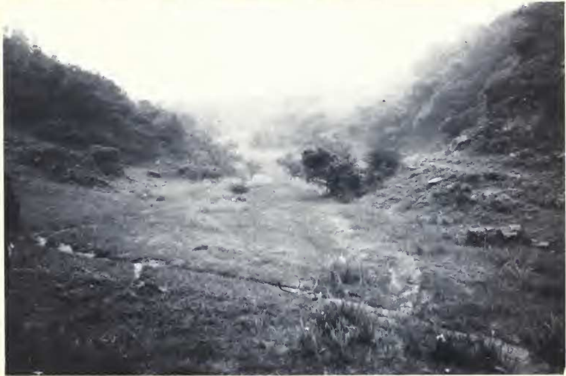
FIG. 3. Vegetation at Qiliba, Sichuan. Above , chaparral at 3020 m; below , wet meadow flanked by chaparral at 3140 m.