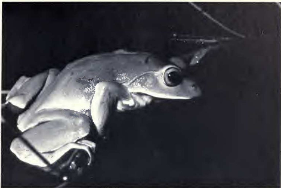
FIG. 8. Polypedates chenfui (Liu); snout-vent length 51 mm.

ovarian development with ova clearly not full-sized.