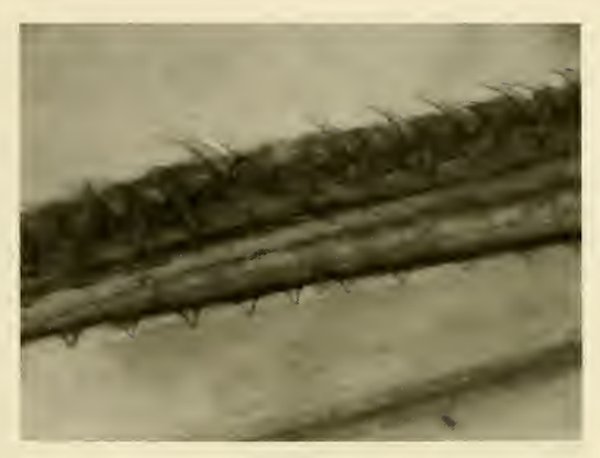
Fig. 2. Hisonotus candombe, spec. nov. Pectoral spine showing the serrae on the posterior margin of the spine (×50).

Color in life: ground color of dorsum and flanks bright green, ventral surface of head and trunk pale yellowish. Narrow light stripes from snout tip to eye and from eye to lateral tip of postemporo-supracleithrum. Dorsum of body, upper third of flanks, and