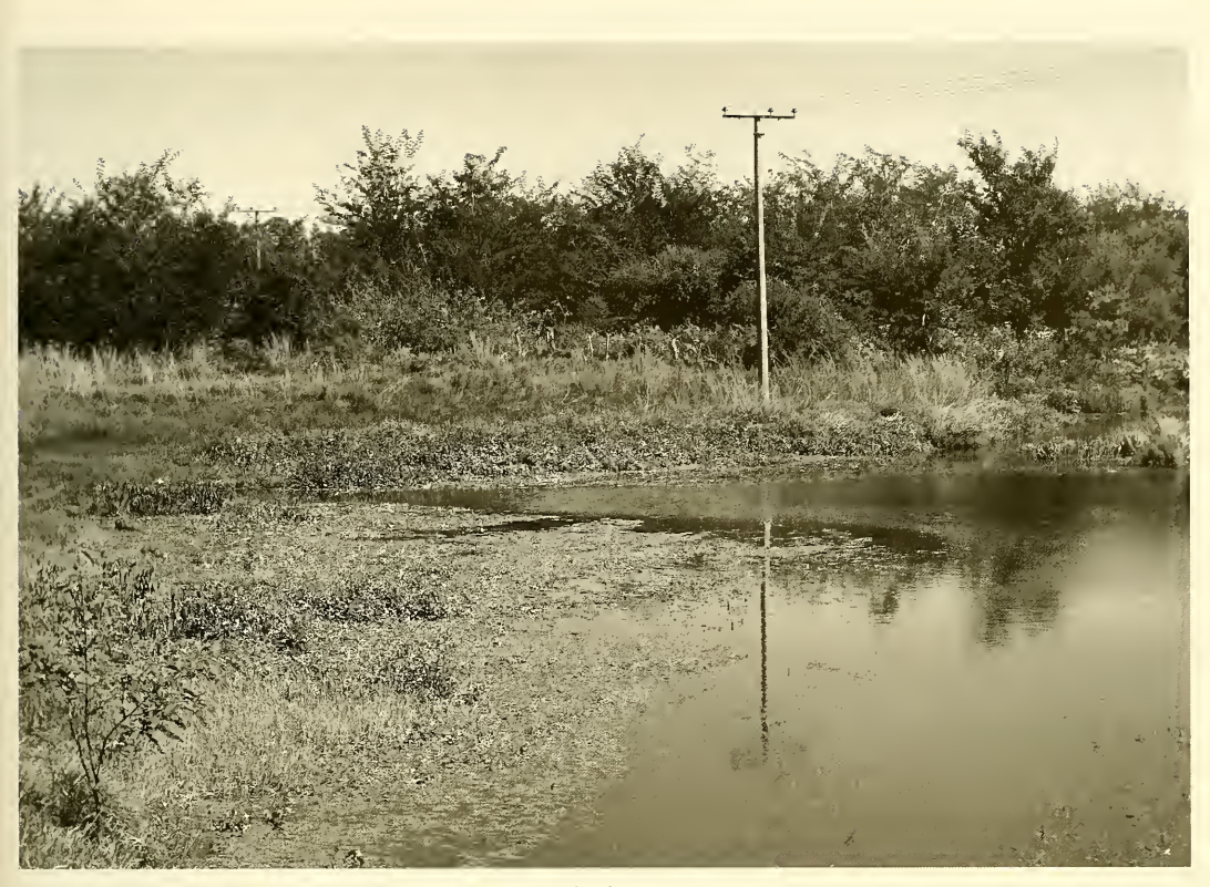
Fig. 4. Arroyo Palomas, type locality of Hisonotus candombe spec. nov.

er, 1891): AI 178, 6 ex., 30.0-38.0, Brazil, Rio Grande do Sul, São Leopoldo, Yacuí, rio dos Sinos. Hisonotus sp. B, AI 120, 1 ex., 23.3, Argentina, Misiones, río Uruguay basin, arroyo Oveja Negra. Hisonotus sp. C: MHNG 2408.025, 10 ex., 17.8-29.0, Paraguay, route 2, arroyo Pirayu. Hisonotus ringueleti Aquino, Schaefer & Miquelarena, 2001: AI 179, 1 ex., 36.4, República Oriental del Uruguay, Departamento Artigas, río Uruguay basin, arroyo Lenguazo. Hypoptopoma inexspectatum (Holmberg, 1893): AI 119, 1 ex., 35.0, Argentina, Corrientes province, río Paraná, Puerto Abra. Otocinclus flexilis Cope, 1894: AI 117, 2 ex., 36.0-36.5, Argentina, Entre Ríos province, arroyo Ñancay. Otocinclus vestitus Cope, 1872: AI 118, 3 ex., 26.0-30.4, Argentina, Corrientes province, río Paraná, Puerto Abra. Otocinclus vittatus Regan, 1904: AI 121, 1 ex., C&S, 27.0, Argentina, Corrientes province, río Paraná, Ita Ibaté. AI 127, 1 ex., 26.2, Argentina, Buenos Aires province, Río de la Plata basin, arroyo El Pescado. Epactionotus yasi Almirón, Azpelicueta & Casciotta, 2004: MACN-ict 8649, 1 ex., 32.0, Argentina, Misiones province, río Iguazú basin, arroyo Lobo. Epactionotus aky Azpelicueta, Casciotta, Almirón & Körber, 2004: AI 124, holotype, 30.5, Argentina, Misiones province, río Uruguay basin, Arroyo Garibaldi.